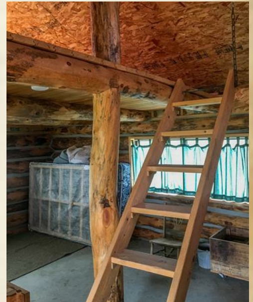
Spike Camp Cabin