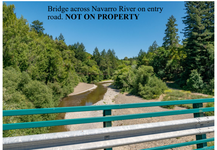
Bridge across Navarro River on entry road. NOT ON PROPERTY