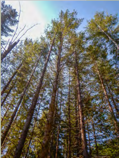
Tree farm has a highly productive Douglas-fir site index of 132