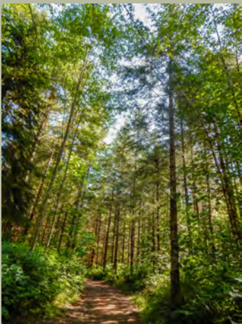
Existing logging road system provides access to bulk of tree farm