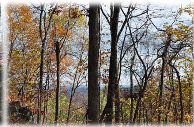
The view from Waterfall Lane is majestic.

This 50 acre property encompasses much of the southern and eastern face of Carson Mountain offering impressive views of the Blue Ridge foothills to the East. The property forms a gentle bowl with several small streams that run down Carson Mountain and eventually run into the Rappahannock River. The land is heavily forested with second growth forest. There are several suitable building spots at varying elevations throughout the property all of which offer magnificent views.