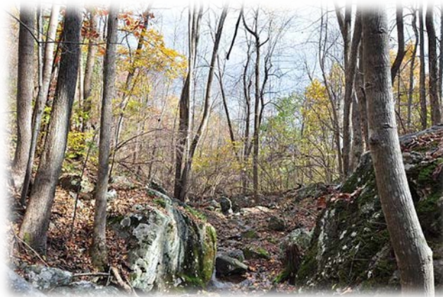
Foot of the Mountain Run eventually becomes the Rappahannock River.