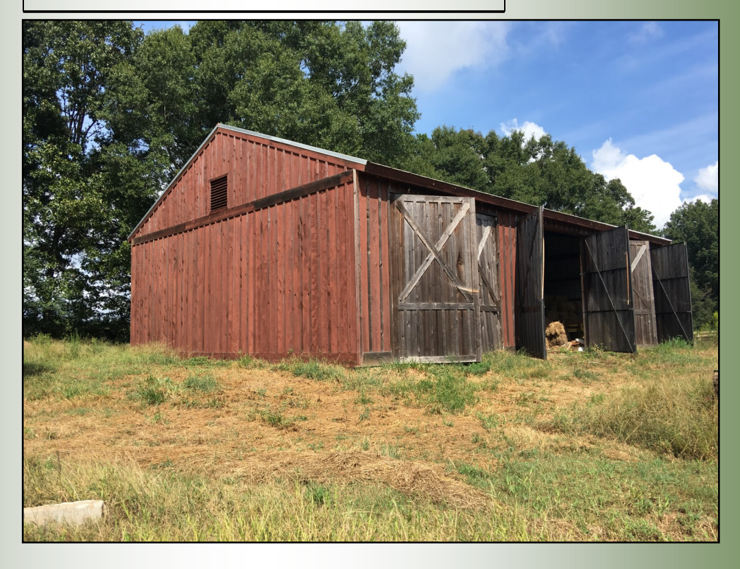
82 Acres | Hwy 98 West | Madison County, GA | 30530