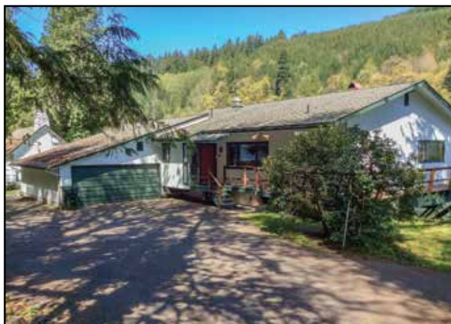
Home had been well-maintained

There is a large bedroom with folding doors to the great room. The prior owner had used the great room as a game or recreation room, with pool table. It can easily accommodate several bunkbeds. The master suite with bathroom is at