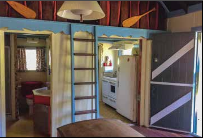
Vintage cabin near home has Swedish decorative folk painting and will require renovation for a studio or rental

SEALED BIDS DUE NO LATER THAN 5:00 PM, NOVEMBER 14, 2018