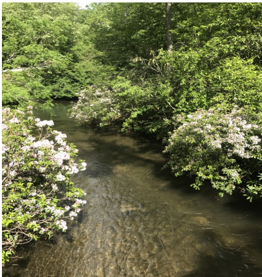
Betty's Creek at bridge below property