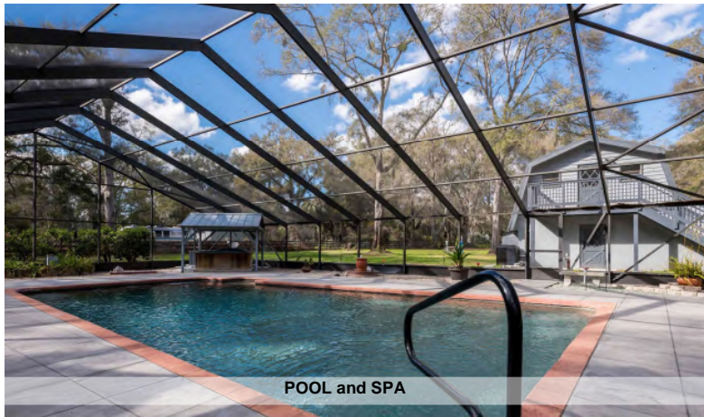
POOL and SPA