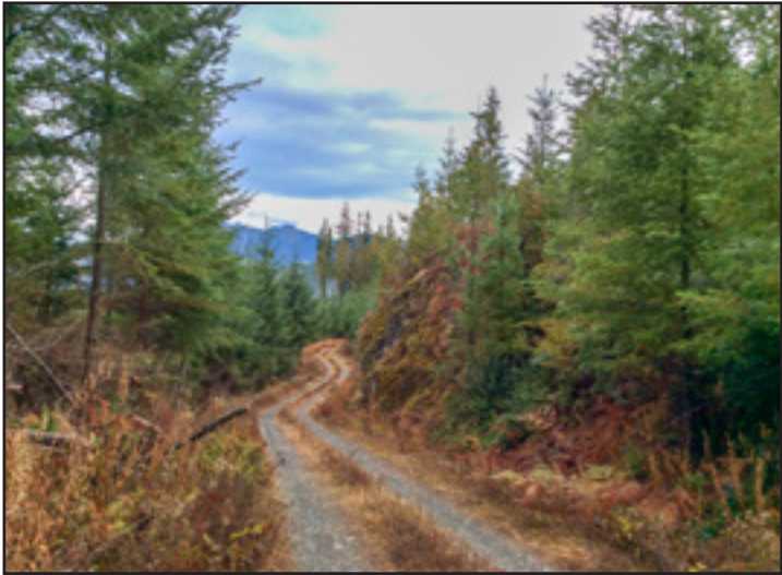
Logging roads are rocked