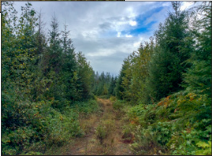
Well-stocked reproduction in southeast section of tree farm

SEALED BIDS DUE NO LATER THAN 5:00 PM, MAY 22, 2019