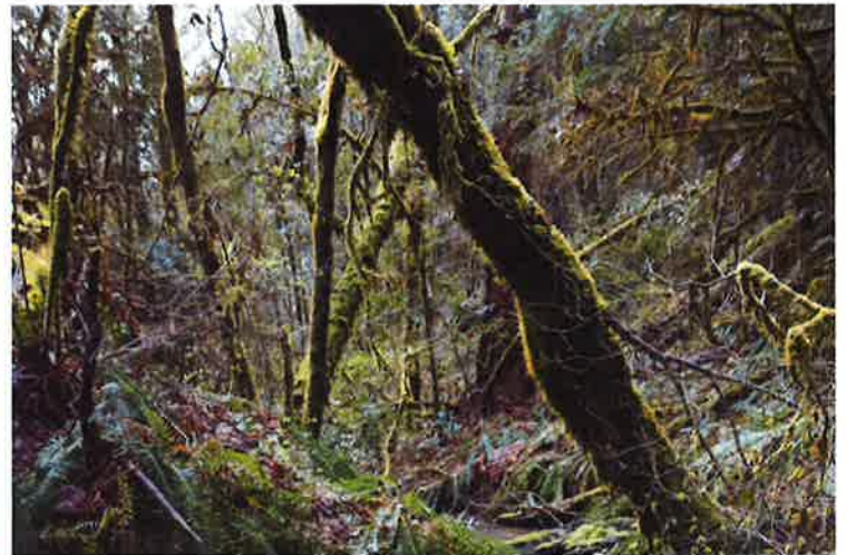
South Fork Round Prairie Creek