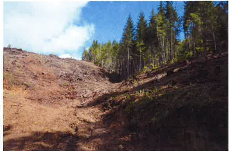
Seller replanted 100± acres in Spring 2017 (see MBG report)