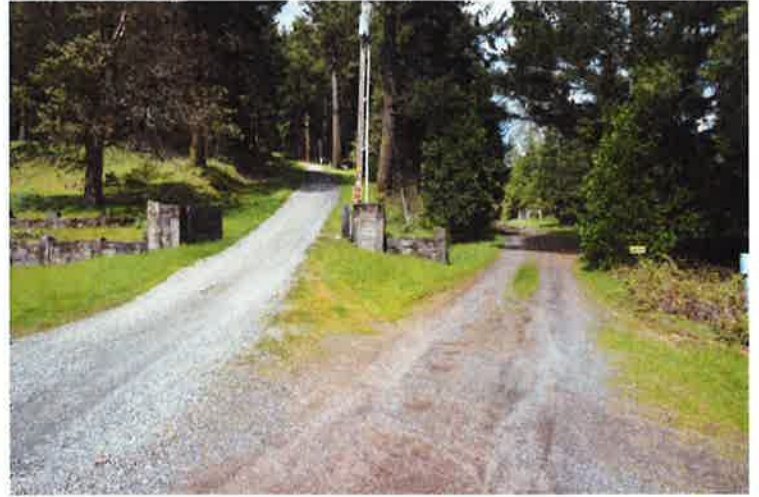
Take 1st fork (uphill to right)