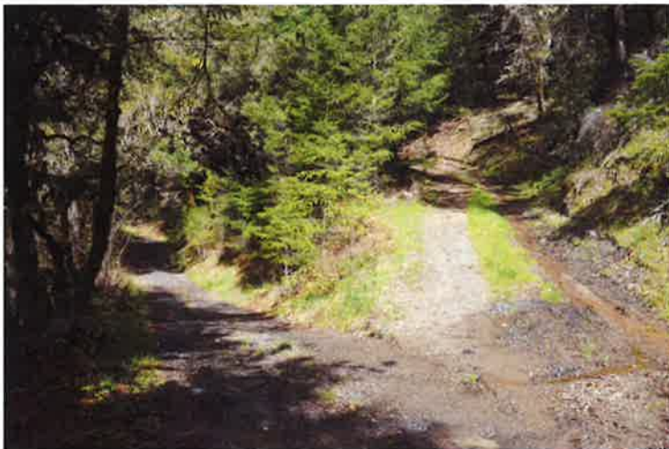
Proceed at final fork to left