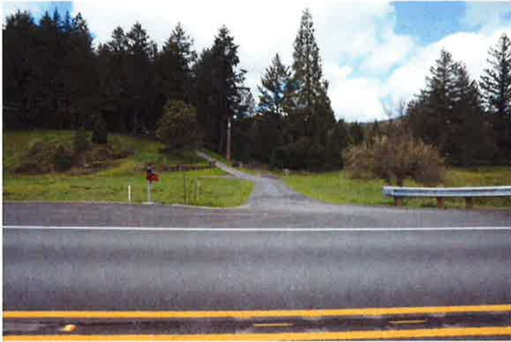
Access road from Highway 199