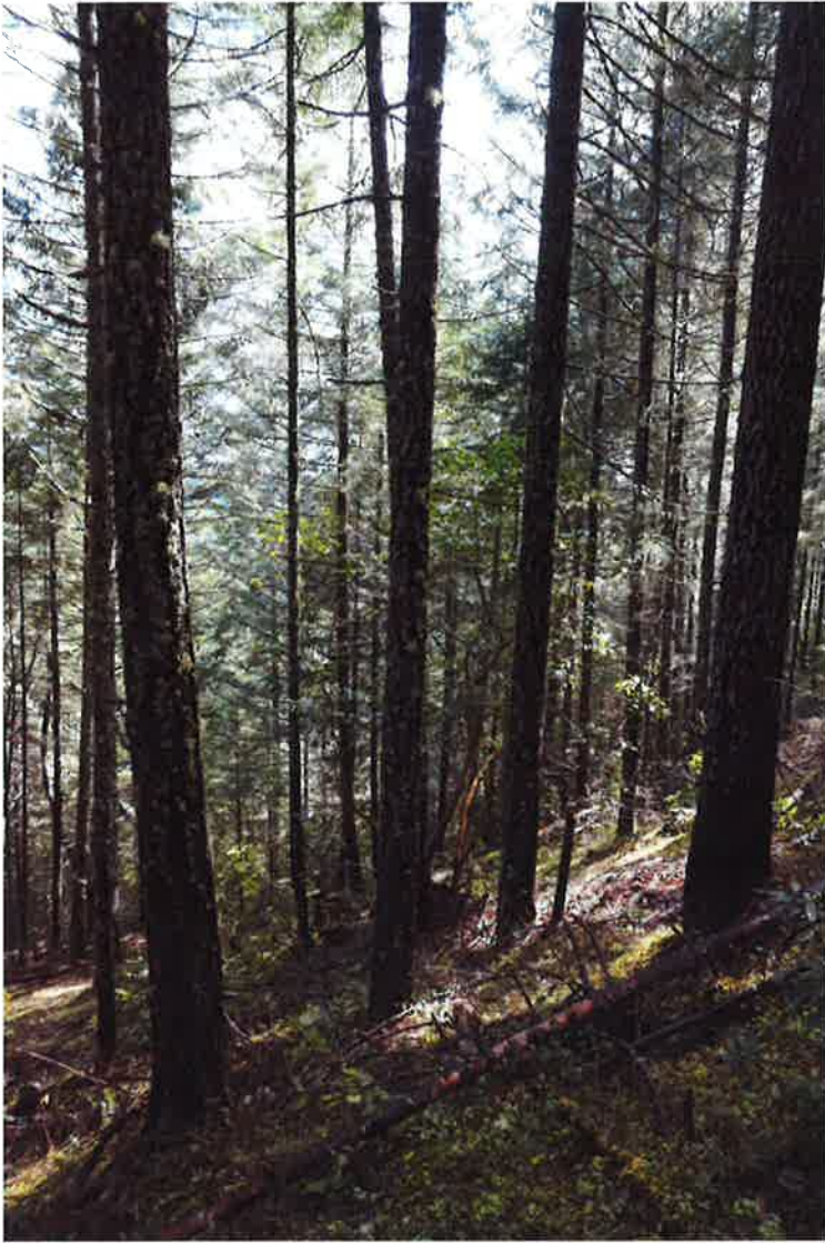
An estimated 60± acres of timber located south of the creek