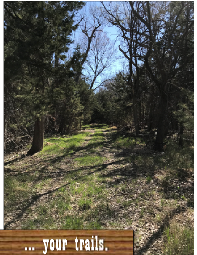
... your trails.