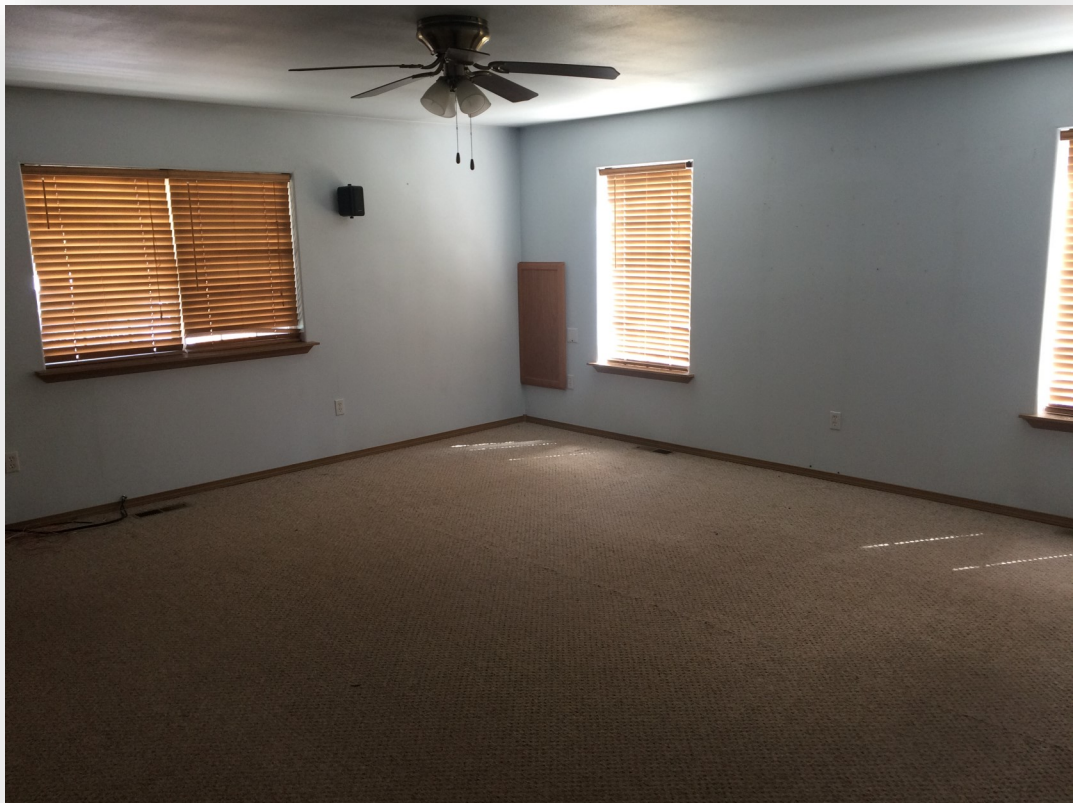
FAMILY/ BONUS ROOM