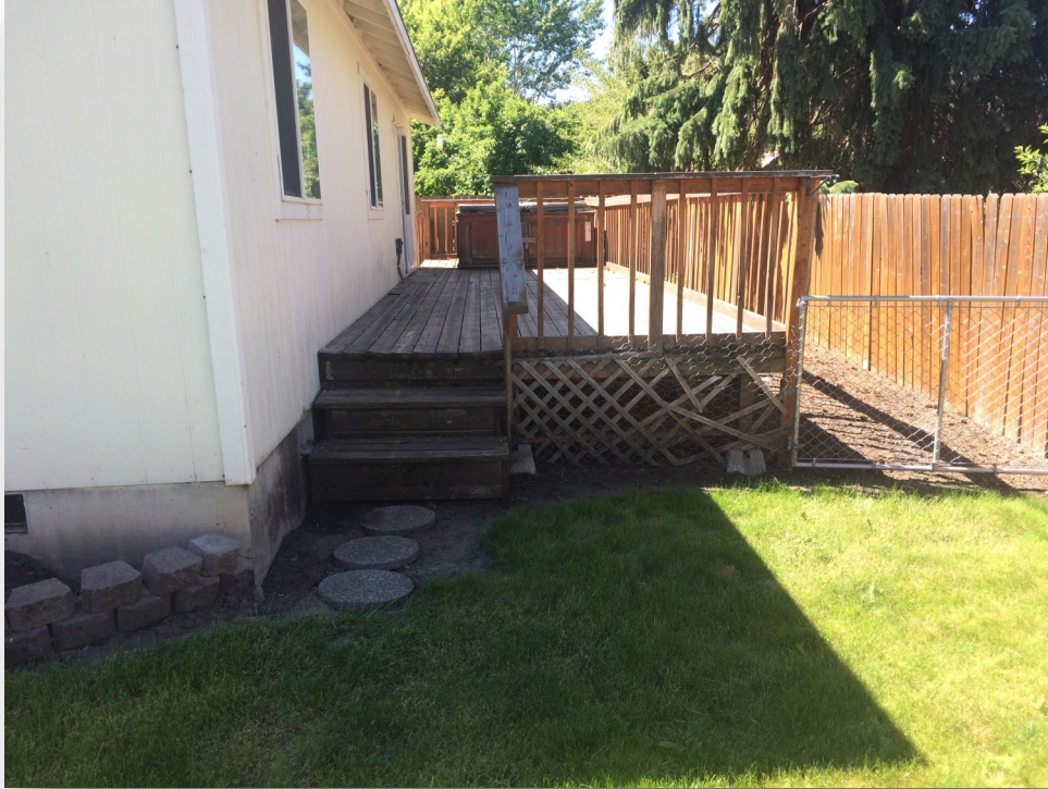
DECK AND HOT TUB