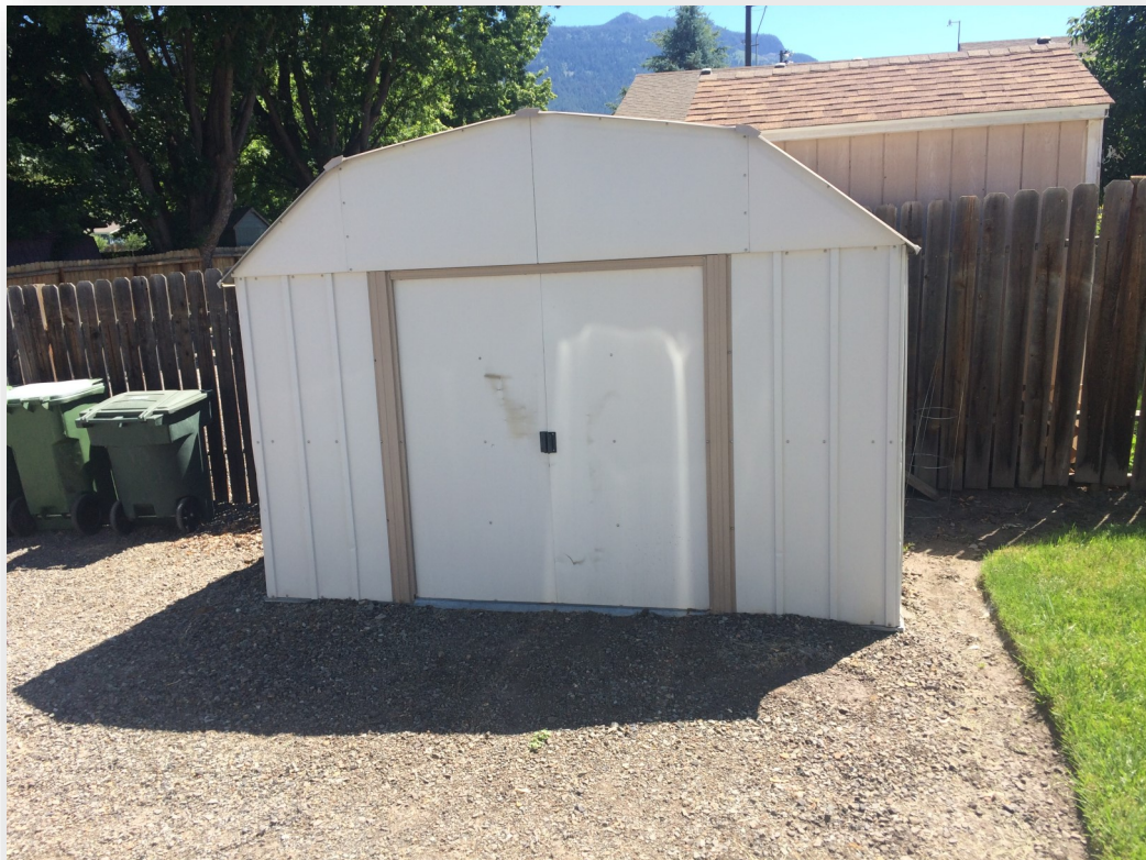
SMALL STORAGE SHED

ALL INFORMATION IS FROM SOURCES DEEMED RELIABLE, BUT IS NOT GUARANTEED BY THIS BROKER OR HIS AGENTS. PROSPECTIVE BUYERS SHOULD CHECK ALL INFORMATION TO THEIR OWN SATISFACTION. PROPERTY IS SUBJECT TO PRIOR SALE, PRICE CHANGE, CORRECTION, OR WITHDRAWAL.