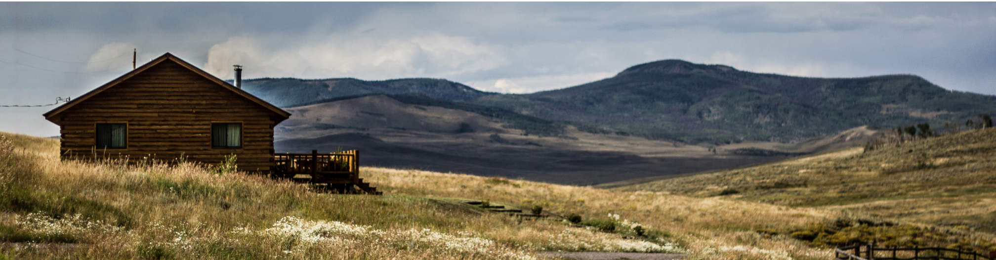
WASHBURN CABIN: This historic cabin on the east side of King Creek Ranch creates a central point for many activities and social functions.