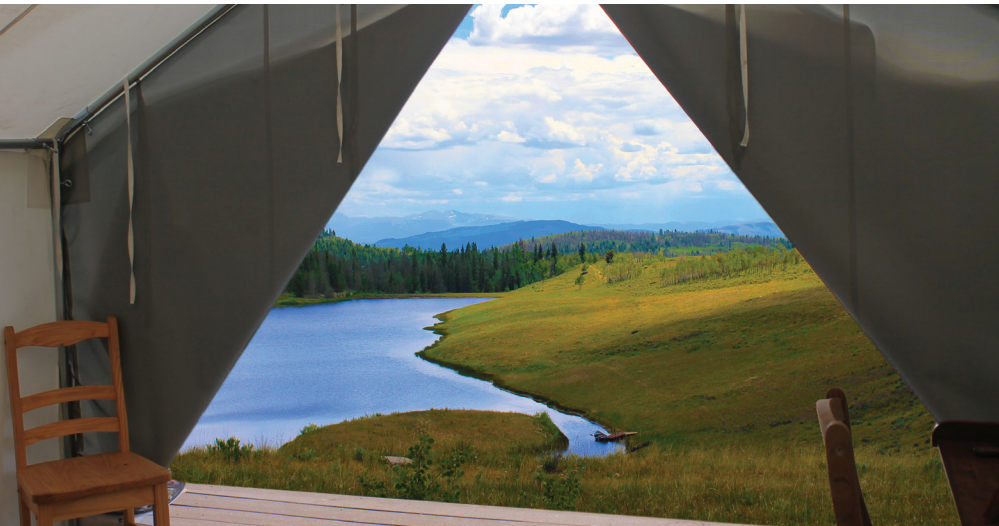
CHESTER CAMP: This one-of-a-kind luxury camping experience comes with a full bathhouse, covered outdoor eating facility, cozy cabins, and fully furnished tents.