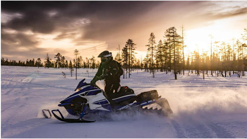
SNOW SPORTS: A full fleet of Arctic Cat powder sleds and a snowcat for backcountry access offers options for high-octane winter adventure. Groomed cross country and skate ski tracks plus snow shoeing trails provide miles of peaceful or rigorous physical excursion into the outdoors.