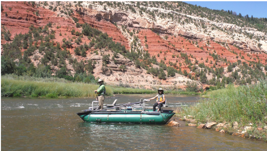
FISHING: Catch large brown and rainbow trout year-round with fishing in three large fishing ponds, more than three miles of Egeria Creek, and a private reservoir. Rafts are always ready for fishing or float trips on the nearby Colorado River.