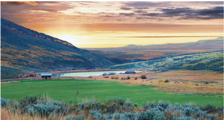
GOLF DRIVING RANGE: The ranch features a custom designed driving range to seamlessly take you from practice to the course.