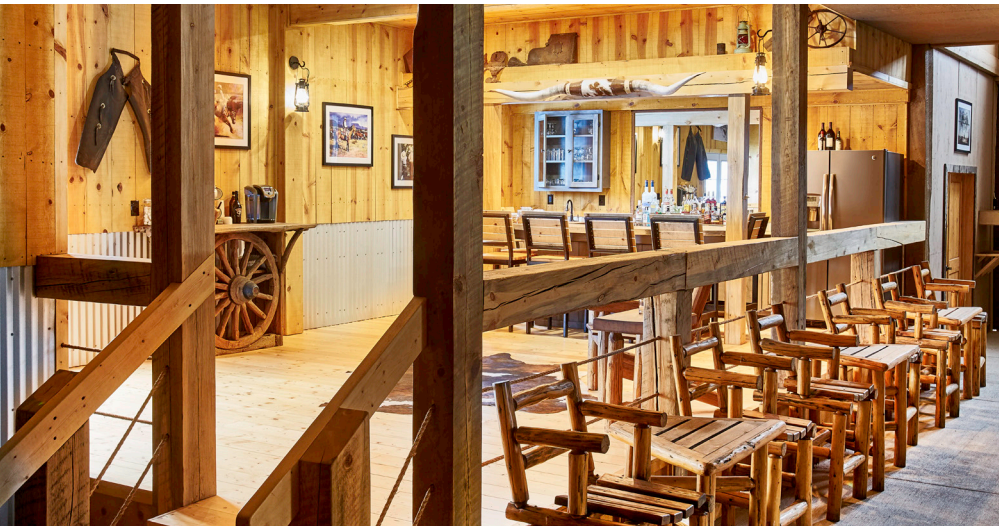
HORSE BARN: This central feature of the ranch includes a custom owner's tack room, a bar area for socializing, and corrals for organized riding activities.