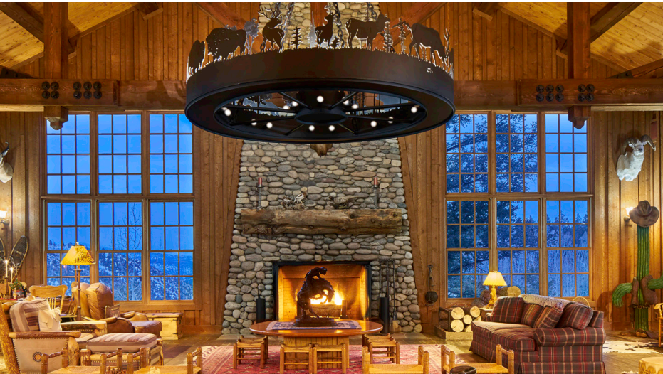
BISON HALL: This fully staffed lodge features a western bar, wine room, large rock fireplace, and guest rooms. Bison Hall is ready for dining, relaxing, visiting, and socializing.