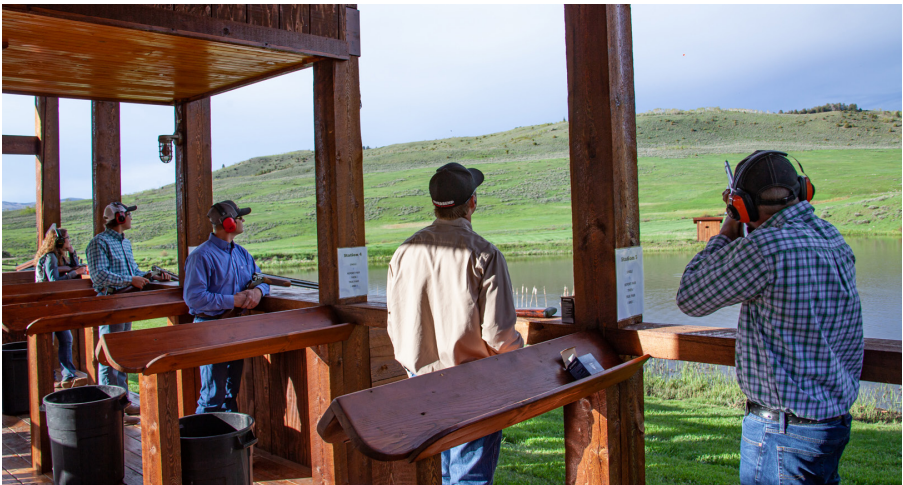
SHOOTING SPORTS: King Creek Ranch has a regulation skeet range, custom 5-stand range, long-range rifle shooting range, pistol range, and 3-D archery range for honing and learning new skills.