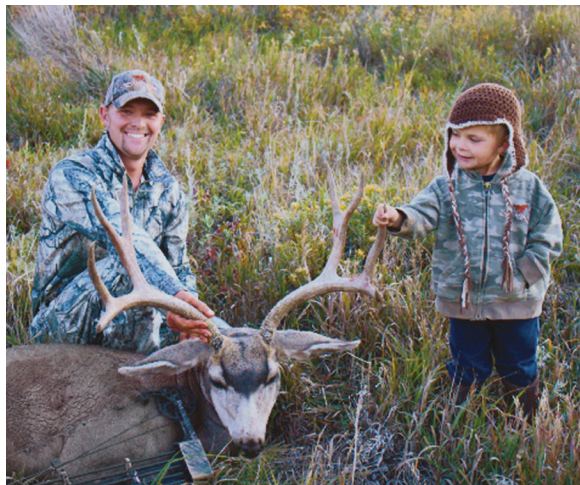
HUNTING AND WILDLIFE WATCHING: World class big game hunting for trophy elk and mule deer is a ranch highlight. This land is also home to coyotes, black bear, mountain lion, red tail hawks, bald and golden eagles, ermine, pine marten, and a variety of other birds and mammals.