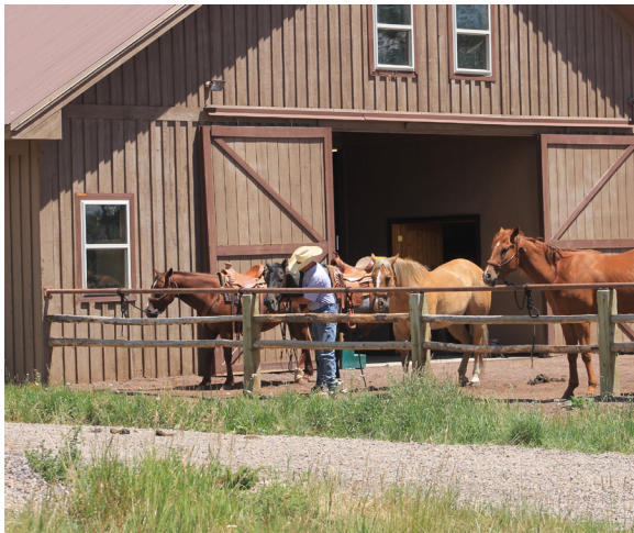
HORSE PROGRAM: King Creek Ranch provides a full staff for riding lessons, basic training, and complete horse care. Saddle up your own horse or ride one of the many ranch horses. Ride the miles of maintained trails, explore the endless open space, or utilize the custom arena.