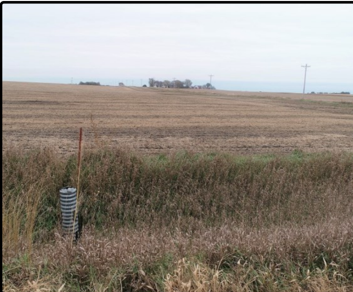
Tile Intakes in Ditches