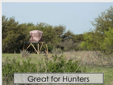
Great for Hunters