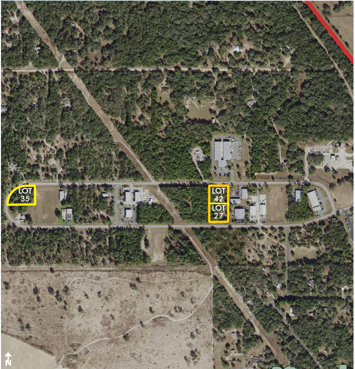
CITRUS INDUSTRIED INDUSTRIAL PARK MAP

— Commercial Real Estate Investments | Management | Brokerage | Development | Land