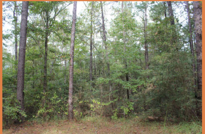
View along woods road