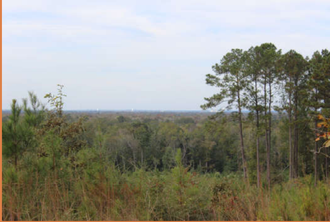
View West from tract of Bogalusa