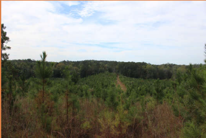
View of 3yr old pine stand