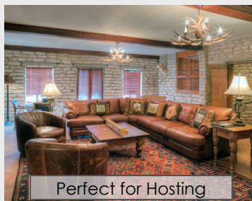
Perfect for Hosting