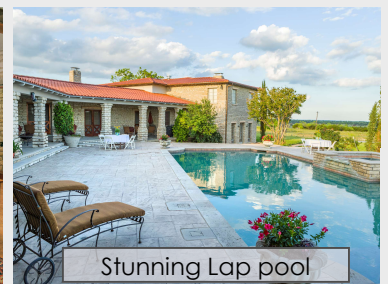
Stunning Lap pool