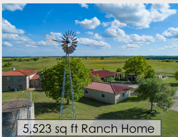
5,523 sq ft Ranch Home

The famed Santa Teresa Ranch is known by many and at one time there was a public steakhouse on the premises. Built in 1939, the southwestern-style hacienda and its extensive grounds were the talk of the country and visited by the Dallas elite. The 5,500+ sq ft. main house, two casitas and nearby pens make up the headquarters. The rest of the ranch is sprawling native range dotted with lakes and long vistas. The ranch has frontage along Hwy 36 and Hwy 22 offering up land development opportunities. It also overlooks the 32 acre city lake and has multiple barns. The ranch is just 2 hours SW of Dallas/Fort Worth and an hour from Waco. Words cannot adequately describe this place...it is truly a MUST-SEE!