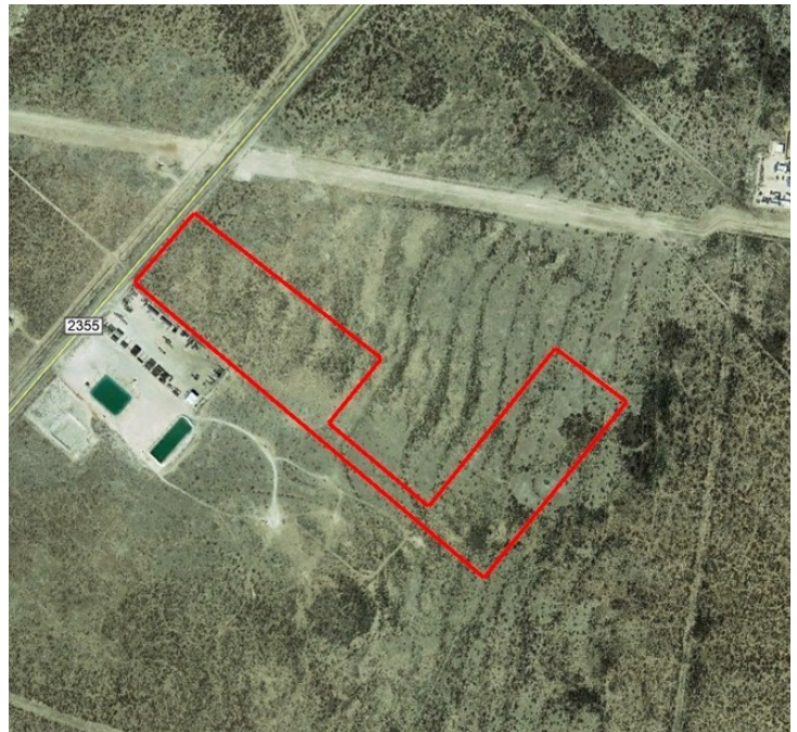
Lots 1, 2 & 7: 33.5 Acres

NRG REALTY GROUP 6191 Hwy 161 Suite 430 Irving, TX 75038 214.534.7976