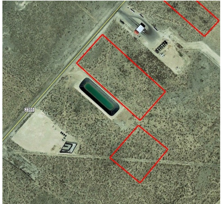
Lots 8 & 9: 10.2 Acres | Lot 28: 5.1 Acres