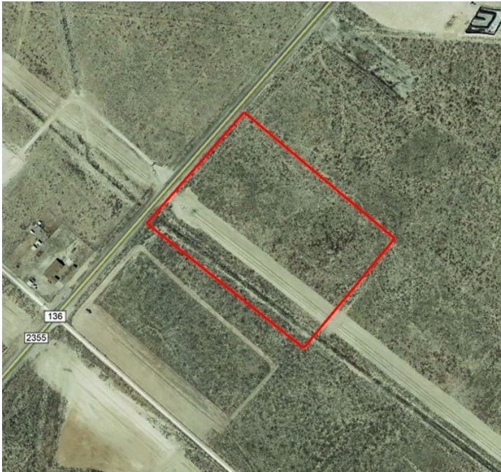
Lots 18, 19 & 20: 15.3 Acres