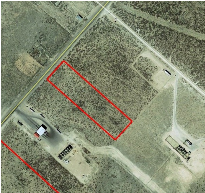
Lot 4: 5.1 Acres