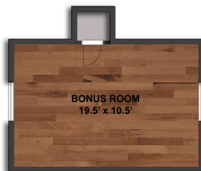
BONUS OVER GARAGE