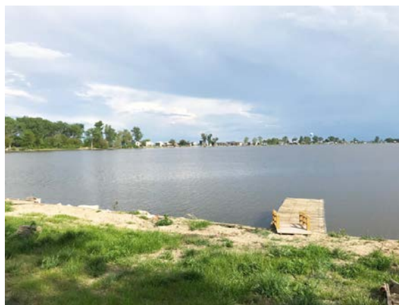
LOT #8 SOLD!

These beautiful LARGE level lots located on the point of Richard's Addition are now being offered for sale and are a once in a lifetime opportunity to purchase! Gorgeous views of the moon, center lake location, sandier lake bottom, good water depth, wrap around concrete & rock seawall, & utility services on site.