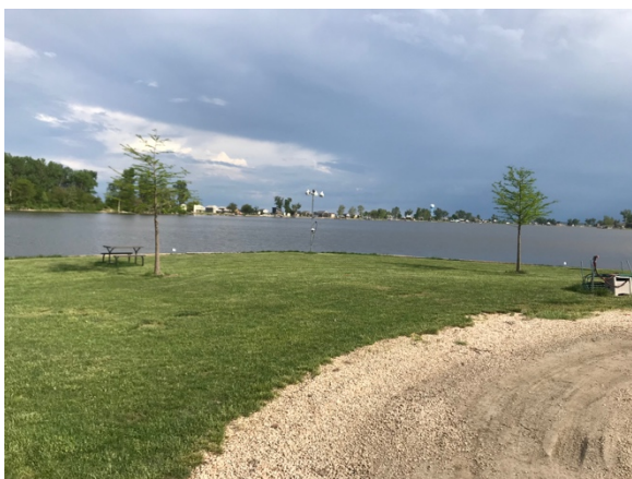
LOT # 7 STILL AVAILABLE!