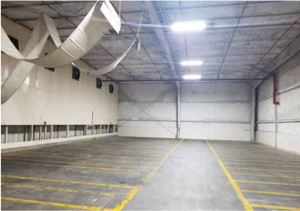
Cold Storage Room