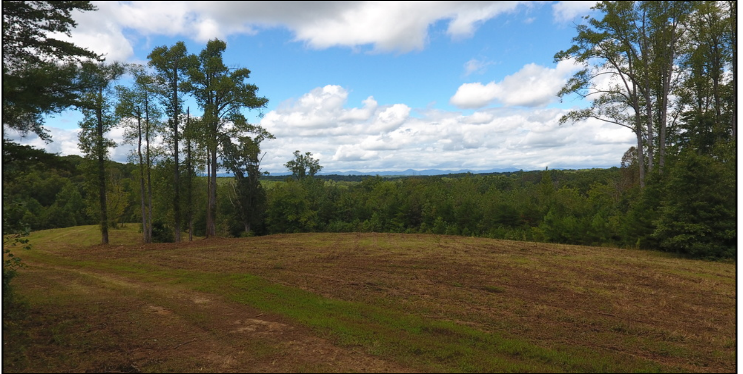
Potential Back Porch View