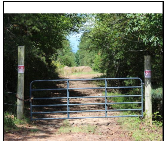
Entrance at Tony Peck Road