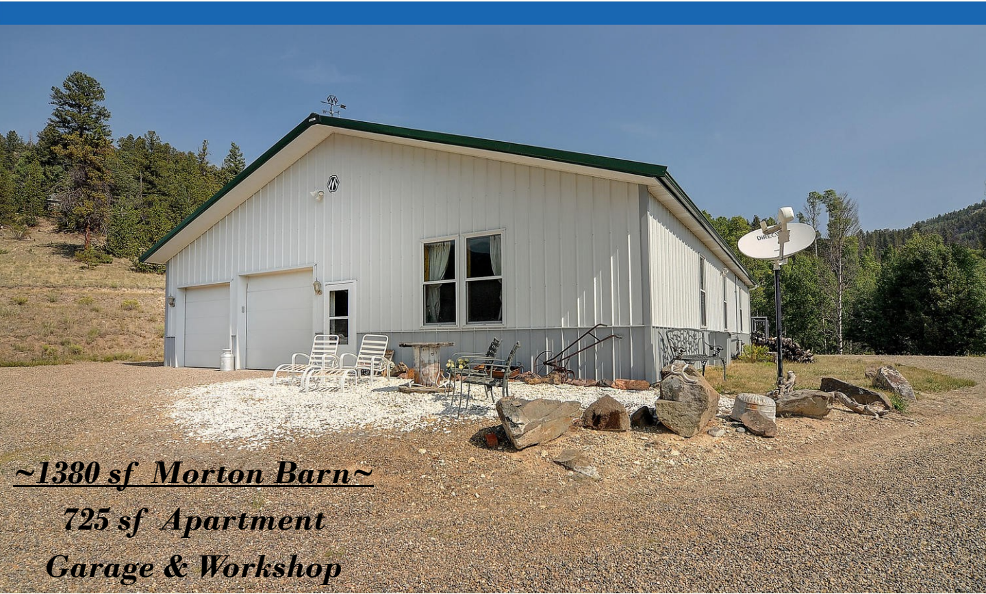
~1380 sf Morton Barn~ 725 sf Apartment Garage & Workshop