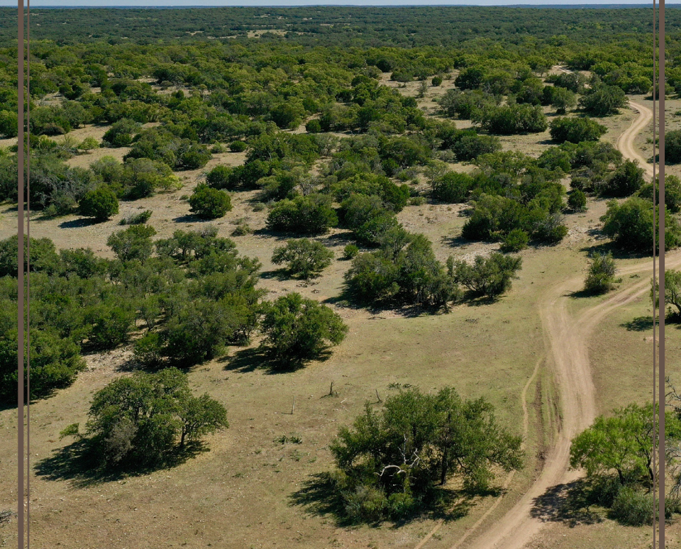
FIGURE 3 SOUTH RANCH

1,245+ Acres Schleicher County Menard-Eldorado, Texas