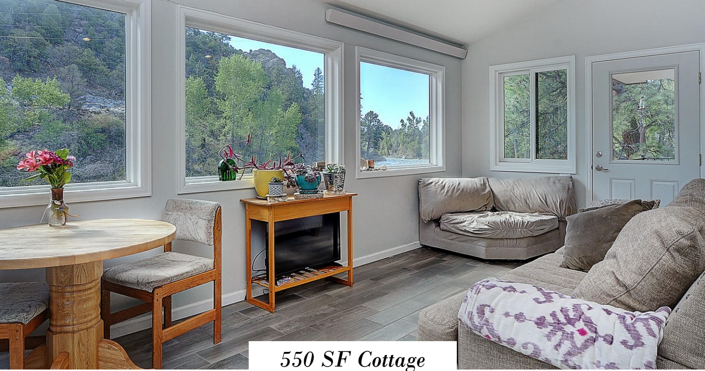
550 SF Cottage 1 Bed / 1 Bath

Incredible opportunity to own .87 acres directly overlooking the Arkansas River with East property boundary to the centerline of the river! Park like setting with two homes currently being utilized as month to month rentals. Ideal scenario for full/part time residence or short/long term rentals. 550 sf frame/stucco cottage was custom built in 2014 and has main level living with breathtaking views both up and down river. Vaulted ceilings, abundant windows and modern finishes including wood grain ceramic tile, maple kitchen cabinets with dovetailed drawers. Private deck for enjoying the sights and sounds of the river and 550 sf lower level storage area with plenty of room for gear. ICF foundation and electric radiant heat with individual thermostats. Washer/dryer unit included. Second home also has fabulous water views from the house and the covered entertainment patio off the 1-car detached garage. It is a 1976 sf double wide with 2 bedrooms, 2 full baths, open floor plan with built in bookshelves/entertainment center, updated carpet and two bonus rooms. Wood burning stove and forced air heat. All appliances currently at the home are included. Hot water heater replaced in 2019 and furnace in December 2018. Homes share well and 2001 engineered septic.