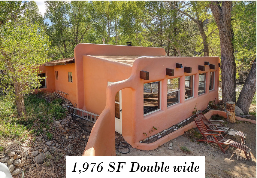
1,976 SF Double wide 2 Bed/ 2 Bath

ALL DATA, MEASUREMENTS, SQUARE FOOTAGE, ETC. DEEMED RELIABLE. NO WARRANTIES OR REPRESENTATIONS EXPRESSED OR IMPLIED.