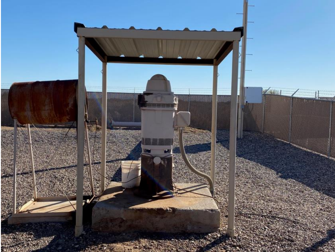
Active irrigation well, 500' deep, 16" casing, 100 HP motor