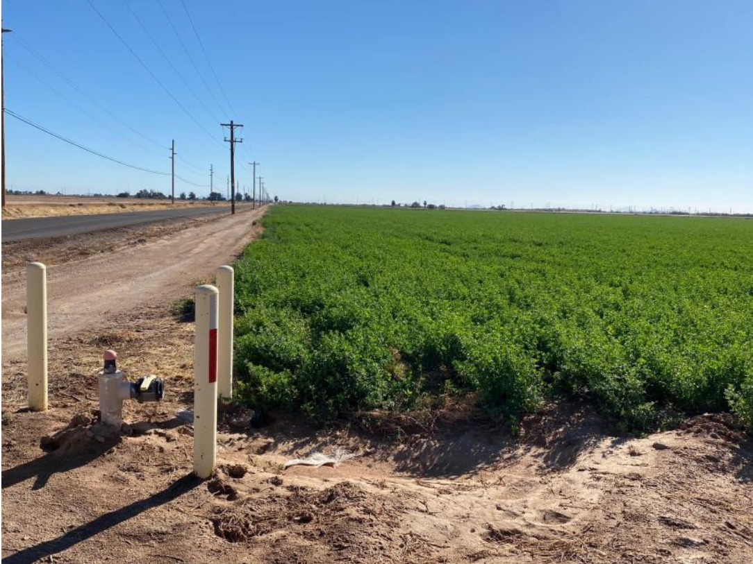
Alfalfa crop, 2020