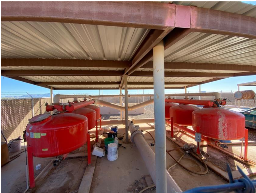
Drip irrigation filtration system