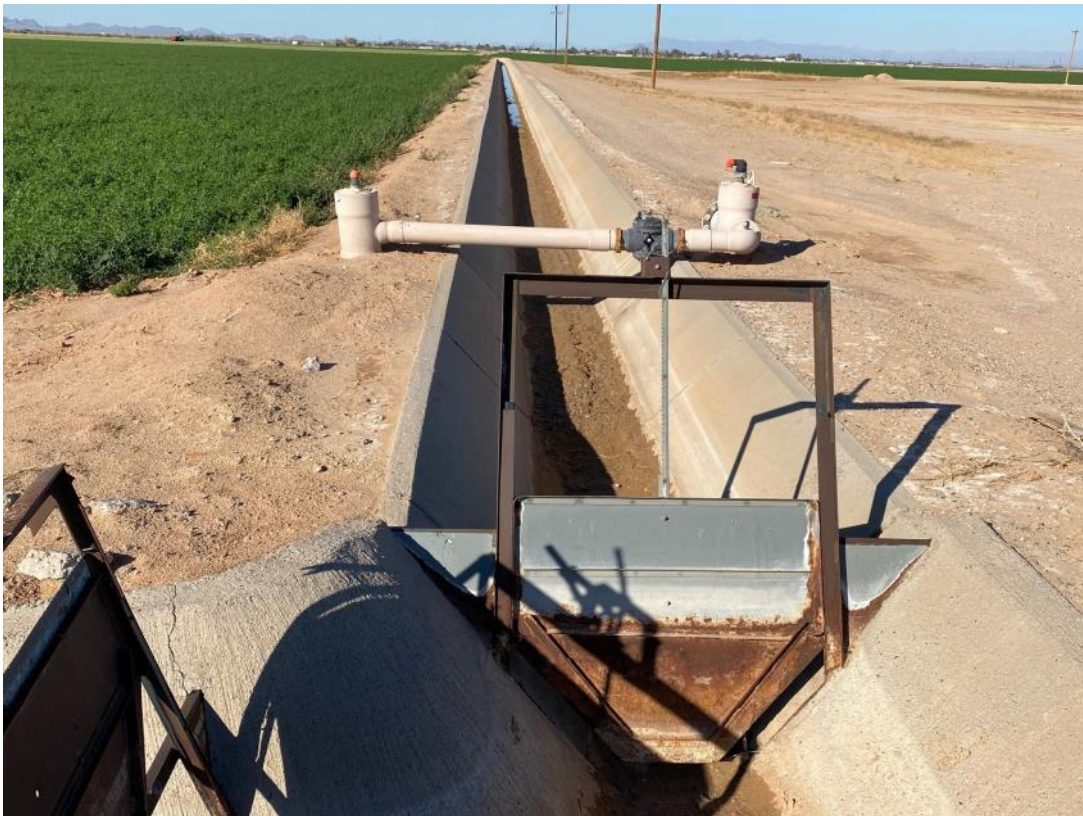
Concrete irrigation ditches maintained