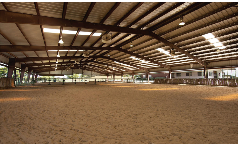
Unique covered arena is large enough for any discipline, yet features swinging gates to modify the size for cutting.