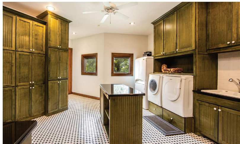
Subway tile motif laundry room is complete with MTI Laundry sink with jets for hand washing, granite folding table, built-in ironing board, and a Whirlpool personal valet air drying cabinet.