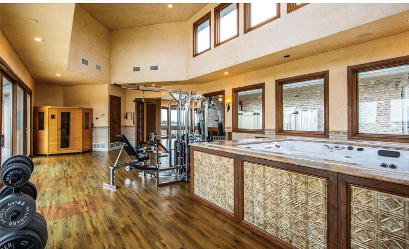
Home gym is adjacent to the master suite with a Dimension One Exercise Pool.