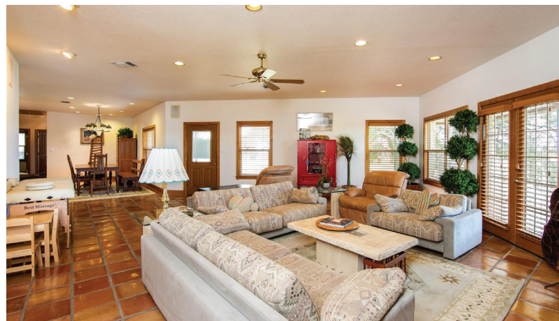
Living room in guest home.