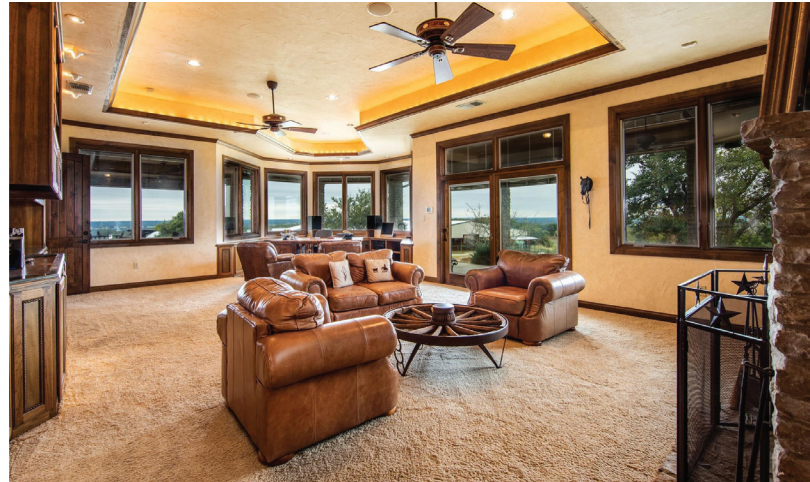
Main office is adjacent to the banquet hall and overlooks the entire horse facility.