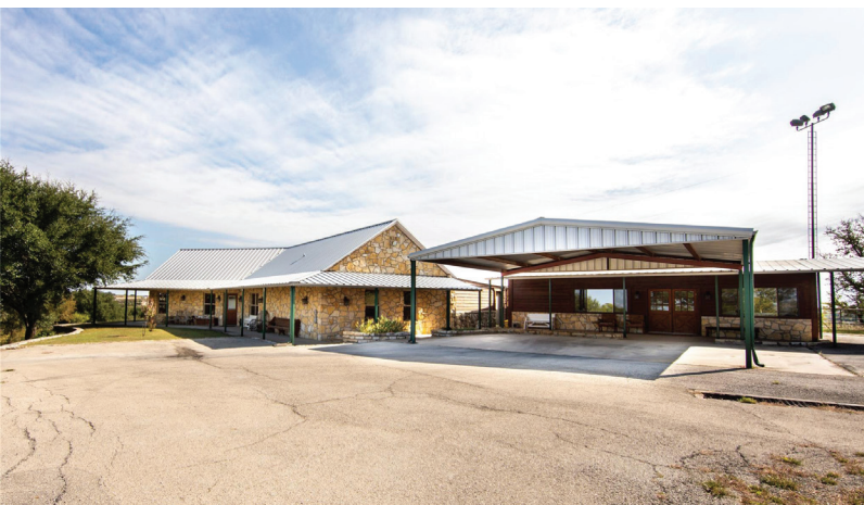
Nicely appointed 3 bedroom 2 bathroom guest house, complete with carport, workout room, and dog runs.