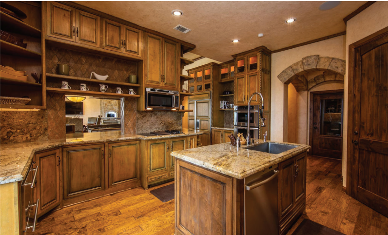
Butler's pantry with pass through to the kitchen is complete with a Miele cooktop, Subzero refrigerator/freezer drawers, and a Bosch dishwasher.