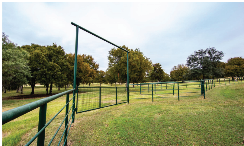
Property is fenced and cross fenced with superb fencing.