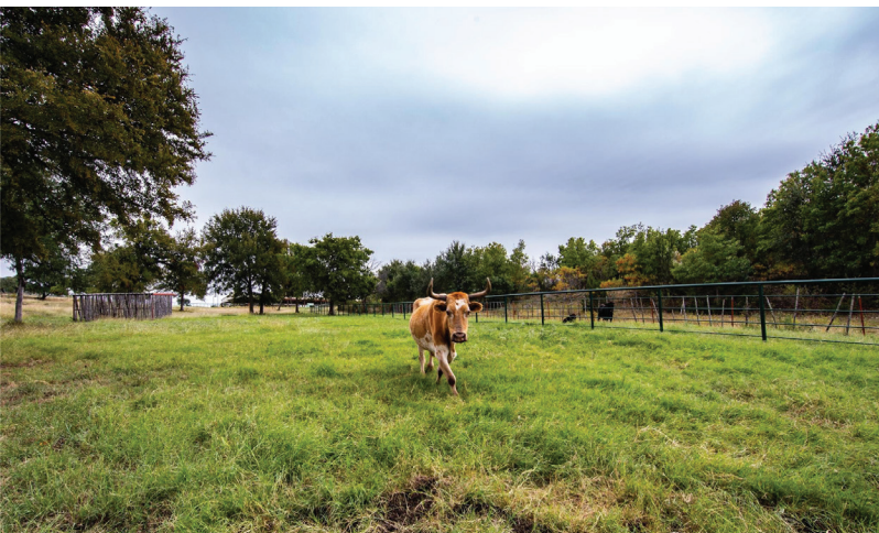
One of multiple paddocks with lush grass.