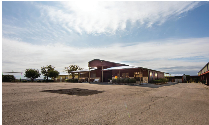
Welcome to the barn!