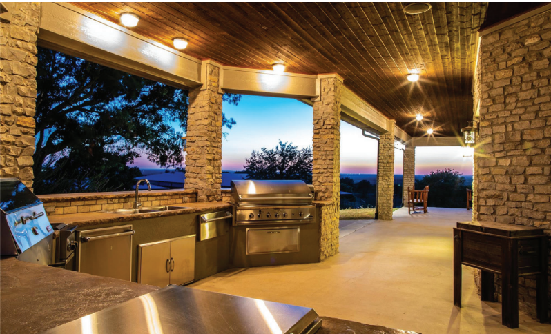
This is an outdoor chef's dream!