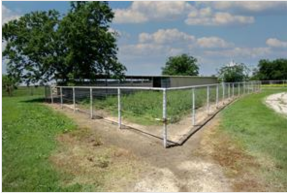
MARE BARN...Approx 36x100, Fifteen - 12x12 Stalls