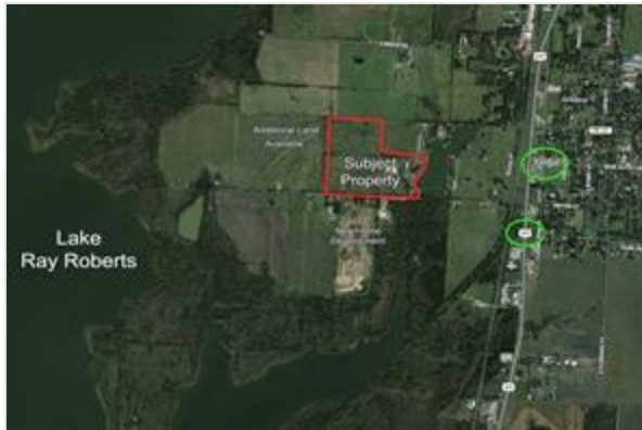
SATELLITE AERIAL...This Shows The Great Proximity Of This Property To Hwy 377 In Tioga, As Well As Lake Ray Roberts!