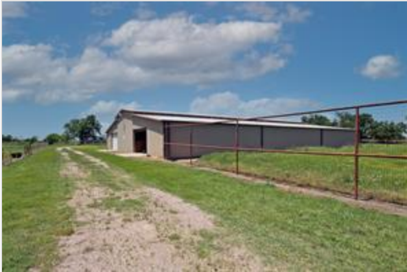
15 STALL INSULATED BARN...4 Overhead Doors (2 On Each End)

MLS Number: 14573268 332 W Hinton Street, Tioga, Texas 76271