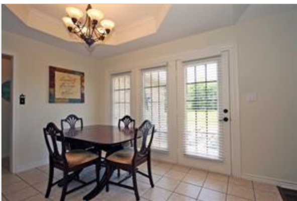
DINETTE...Tile Floor, 2-Inch Blinds, Trayed Ceiling, Door To Back Yard