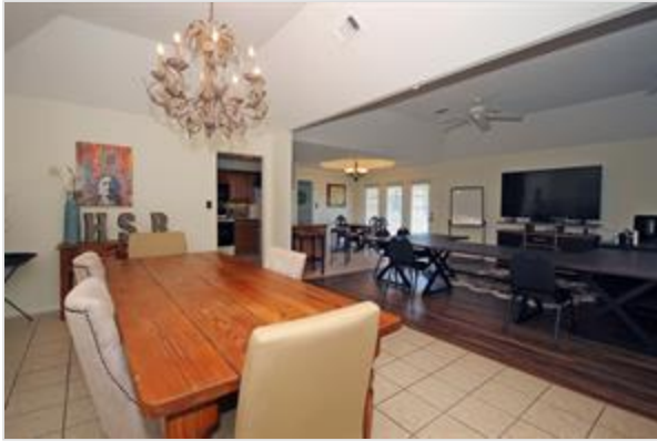
FORMAL DINING ROOM...Tile Floor, Opens To The Living Room, Kitchen, Dinette And Foyer