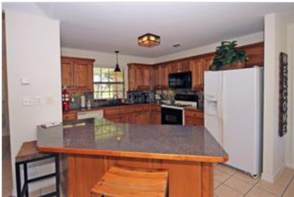
KITCHEN...Tile Floor, Gas Stove, Microwave, Dishwasher, Under Cabinet Lighting, Breakfast Bar