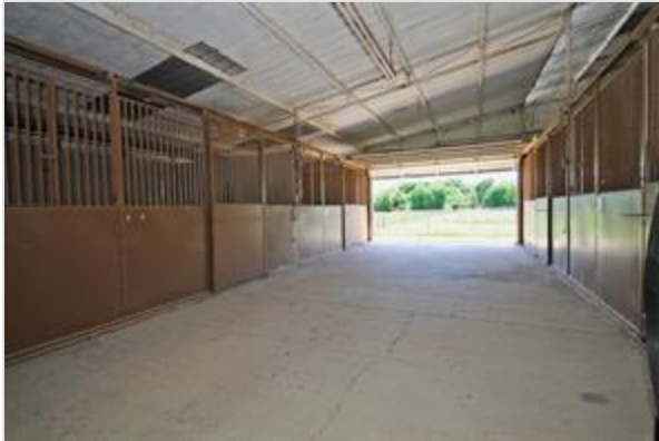
HORSE BARN INTERIOR...Fifteen-12x16 Stalls Total, Insulated, 2 Separate Stall Aisles (8 Stalls On This Side), 2 Wash Racks And Stocks In Center Of Barn, Office, Tack Room And Feed Room