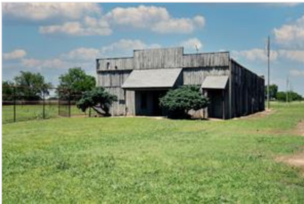
MULTI-PURPOSE BUILDING...Approx 4000 Sq Ft, Insulated, Metal Siding Behind Wood Exterior