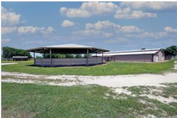
60 FT COVERED ROUND PEN...Attaches To Horse Barn By A Covered Breezeway