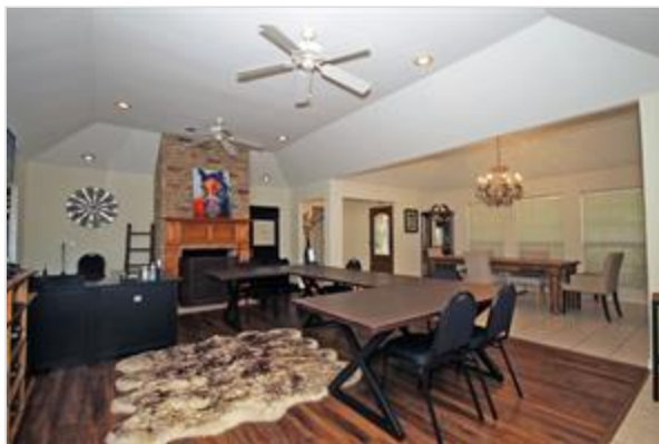
LIVING ROOM - DINING ROOM - FOYER...Home Is Currently Used For Business Purposes