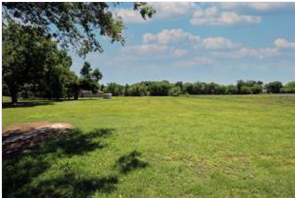
SIDE AND BACK YARD