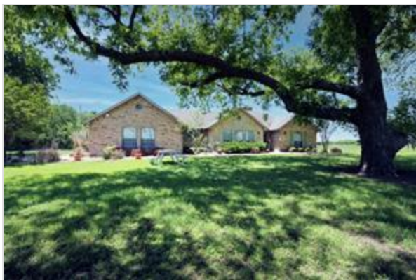
FRONT OF HOME...Extra Photo