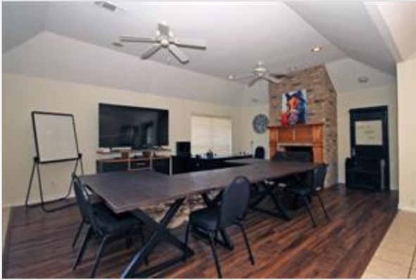
LIVING ROOM...Brick Fireplace

MLS Number: 14573268 332 W Hinton Street, Tioga, Texas 76271