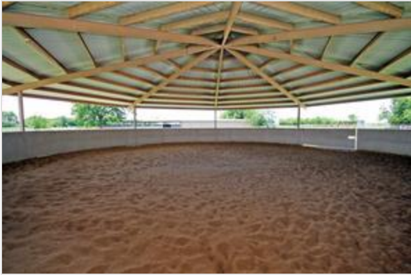
COVERED ROUND PEN INTERIOR

MLS Number: 14573268 332 W Hinton Street, Tioga, Texas 76271