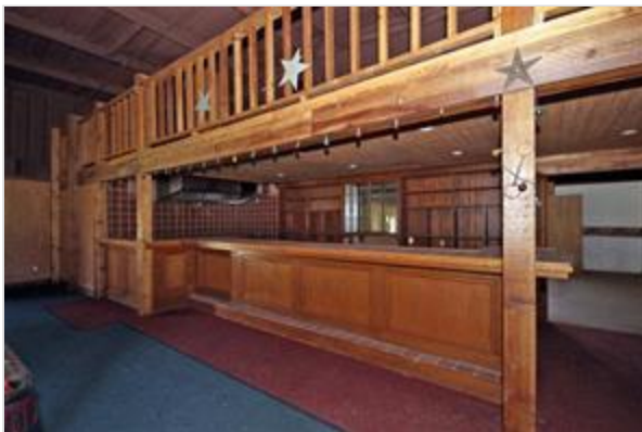
MULTI-PURPOSE BUILDING INTERIOR...Bar Area