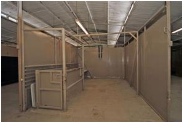
TWO WASH RACKS AND SET OF STOCKS...Located In The Center Of The Barn