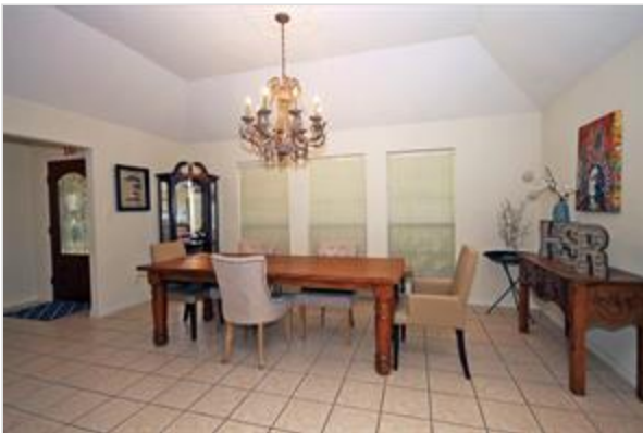
FORMAL DINING ROOM...2 Inch Blinds, Tile Floor And View Of Foyer