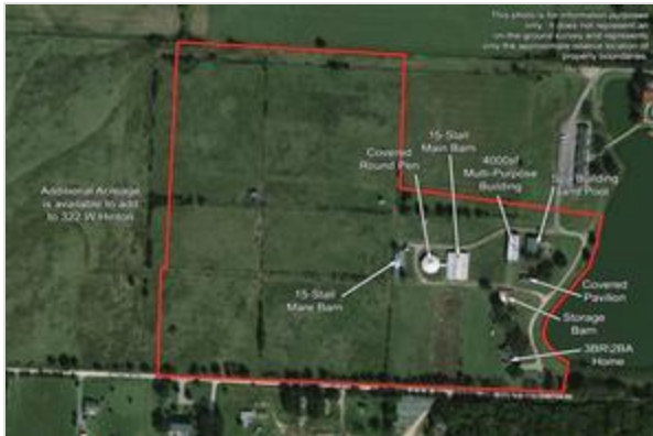
SATELLITE AERIAL...Property Outlines And Tags Are Approximate And For Illustration Only

MLS Number: 14573268 332 W Hinton Street, Tioga, Texas 76271