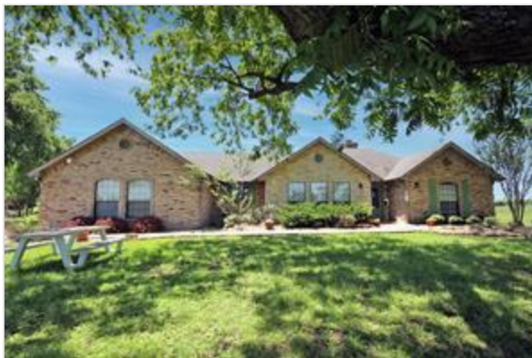
FRONT OF HOME...Gated Entrance, Brick And Stone Exterior And Beautiful Trees!