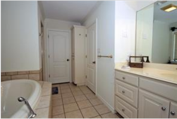
PRIMARY BATH...Tile Floor, Garden Tub, Shower, Built-In Linen Cabinet, W/I Closet

MLS Number: 14573268 332 W Hinton Street, Tioga, Texas 76271