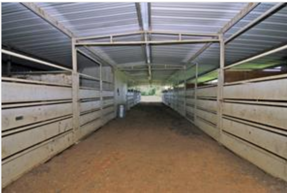
15 STALL MARE BARN INTERIOR...Dirt Center Aisle