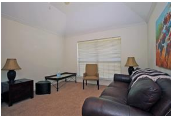
PRIMARY BEDROOM...Carpet, 2-Inch Blinds, Ceiling Fan