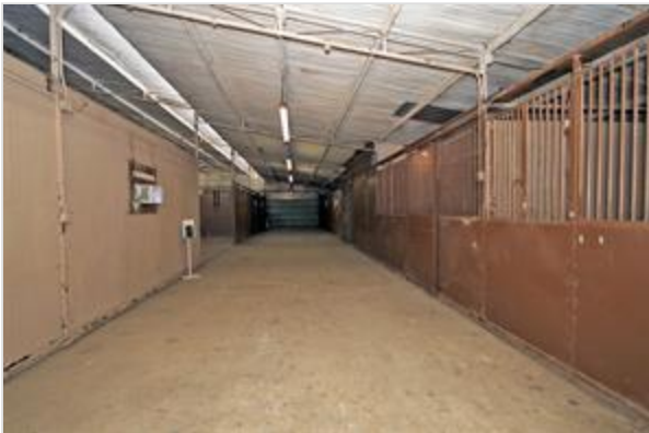
HORSE BARN INTERIOR...West Aisle (7 Stalls On This Side), Overhead Doors On Each End