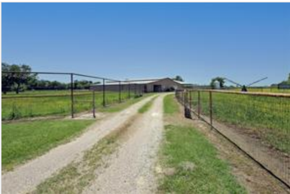
ONE OF TWO DRIVEWAYS LEADING TO HORSE BARN AND MARE MOTEL