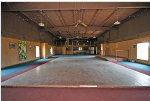
MULTI-PURPOSE BUILDING INTERIOR...Previously Used For Events And Features A Dance Floor, Stage And Bar