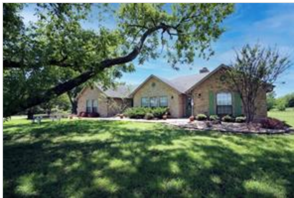
FRONT OF HOME...Extra Photo