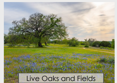
Live Oaks and Fields