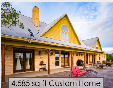
4,585 sq ft Custom Home

The Young Ranch is a one-of-a-kind, 18-year old custom home that sits on a wooded bluff and offers a 270-degree panorama of the Bosque River Valley. Featuring rattlesnake limestone throughout the abode, this exquisitely-designed, 4,585 sq ft house is filled with the ultimate in style and comfort. An observation deck showcases the beautiful country views, while the live oaks provide ample shade. A 2/2 stone guest house, bunkhouse, metal building and 2-car garage make up the additional structures, while a stock tank provides opportunities for fishing and other recreation. The 1/3 mile of accessible Bosque River frontage really puts this property over the edge and makes it a MUST-HAVE! Come and see!