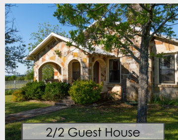
2/2 Guest House