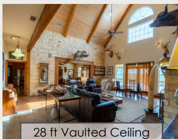
28 ft Vaulted Ceiling