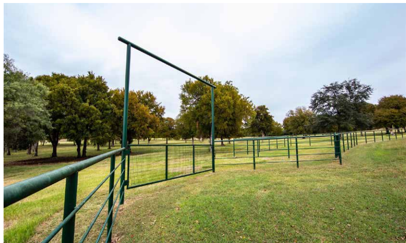
Property is fenced and cross fenced with superb fencing.