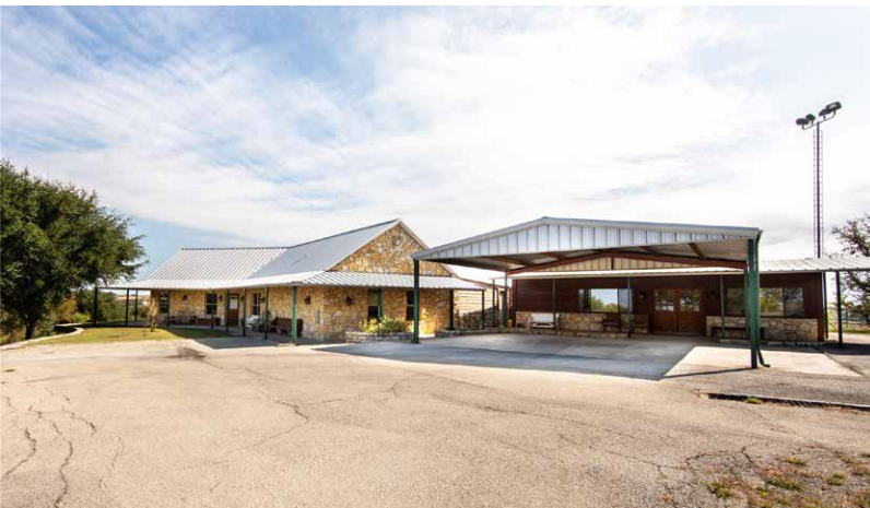
Nicely appointed 3 bedroom 2 bathroom guest house, complete with carport, workout room, and dog runs.