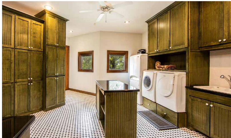
Subway tile motif laundry room is complete with MTI Laundry sink with jets for hand washing, granite folding table, built-in ironing board, and a Whirlpool personal valet air drying cabinet.