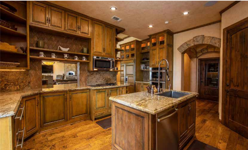
Butler's pantry with pass through to the kitchen is complete with a Miele cooktop, Subzero refrigerator/freezer drawers, and a Bosch dishwasher.