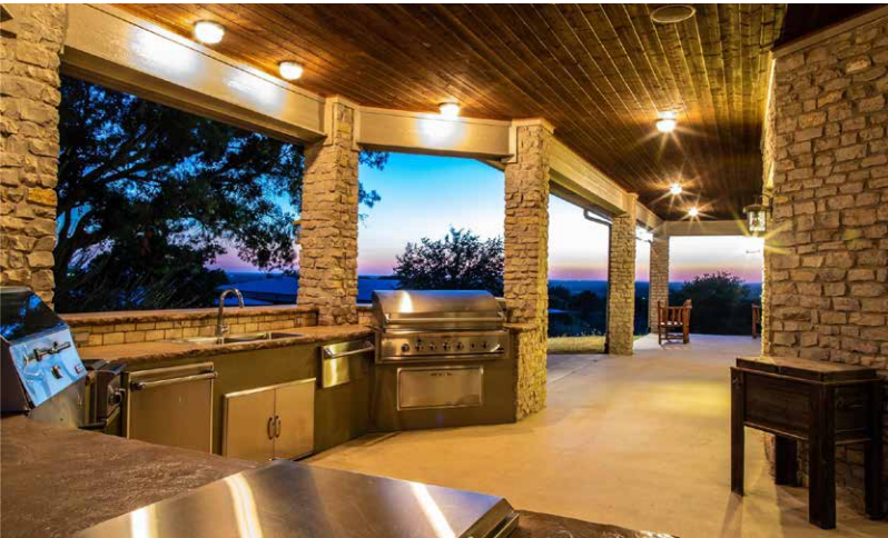
This is an outdoor chef's dream!