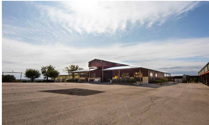
Welcome to the barn!