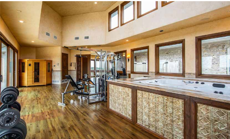
Home gym is adjacent to the master suite with a Dimension One Exercise Pool.