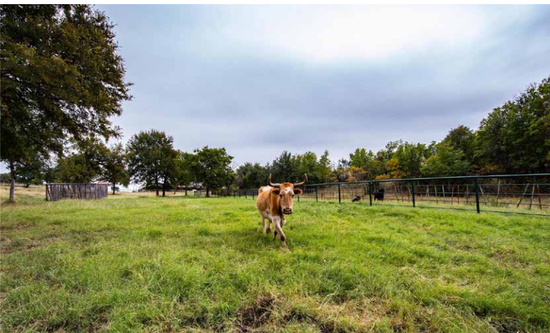
One of multiple paddocks with lush grass.