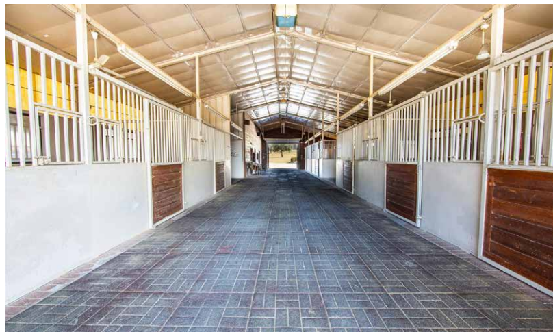
Main barn features 9 oversized stalls, a nice apartment, vet room, and tack room.