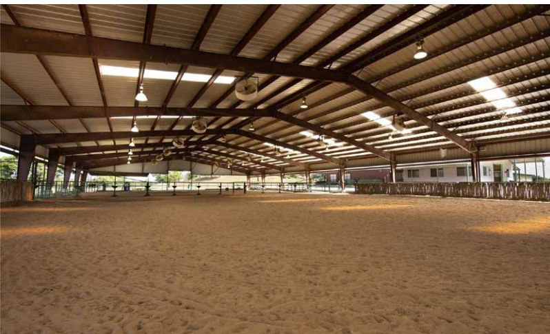
Unique covered arena is large enough for any discipline, yet features swinging gates to modify the size for cutting.