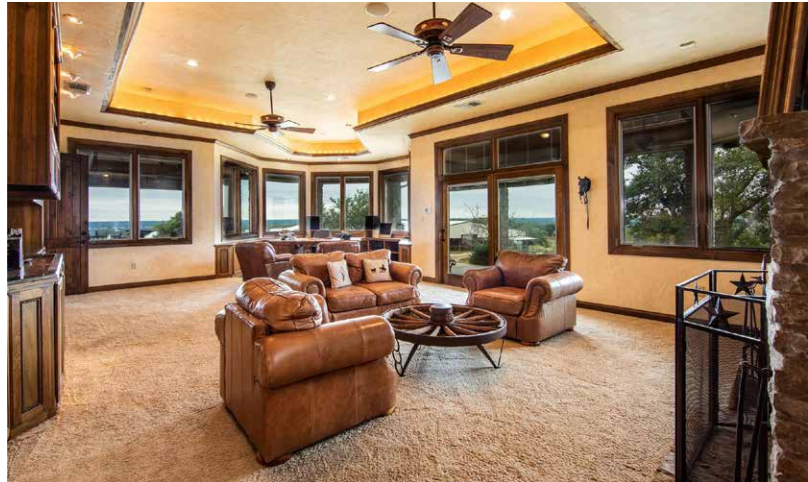
Main office is adjacent to the banquet hall and overlooks the entire horse facility.