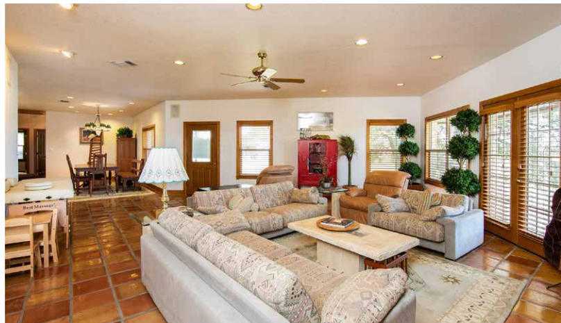
Living room in guest home.