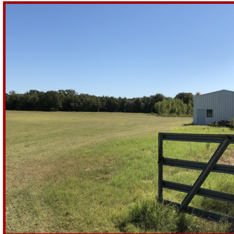
Hay Producing with Equipment Shed