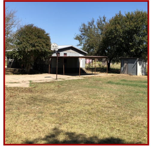
3/2 Doublewide (1456 sf) & Storage