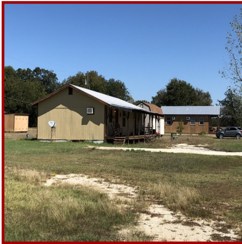
2 Sets of Duplexes with Storage