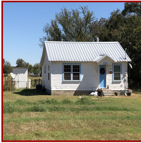
3/2 House (1084 sf) & Storage