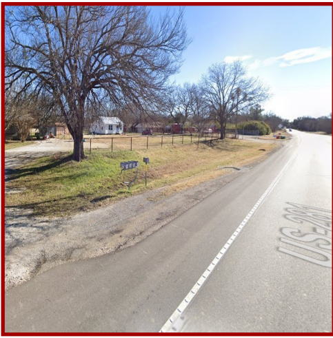
S. US Hwy 281 Frontage ~ 45.22 ac