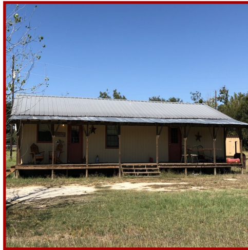
1200 sf Total ~ 2/1 & 1/1