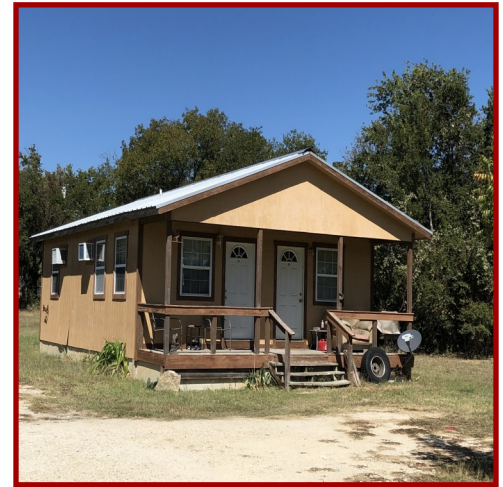
768 sf total ~ Both 1/1