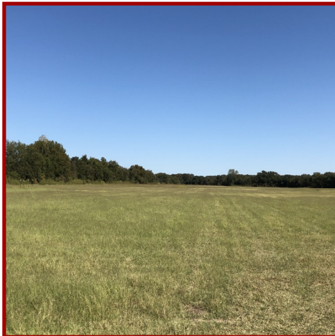
38.74 ac Coastal Field