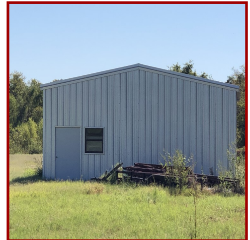
1200 sf Shed