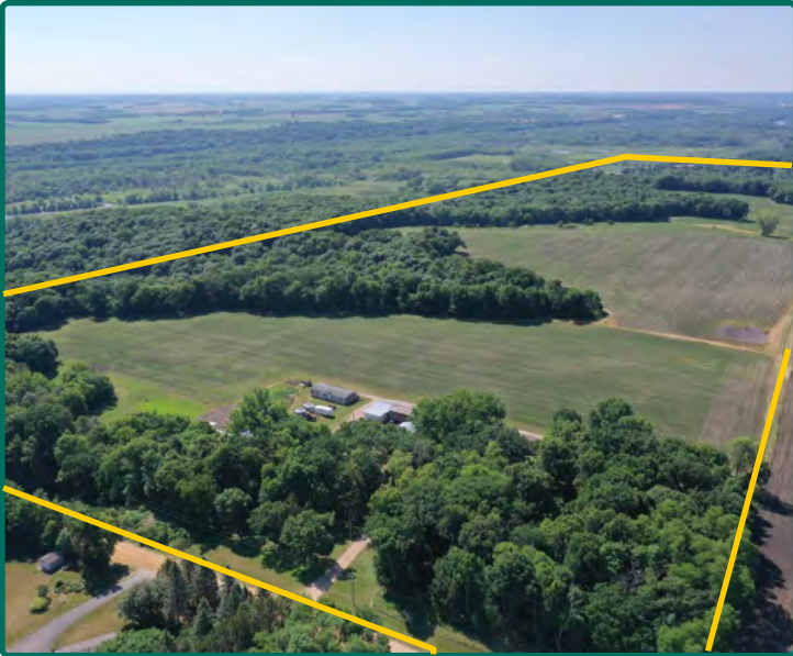
Northwest Corner Looking Southeast