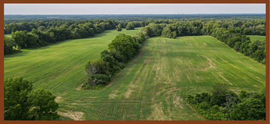
A close-up of the west side of the property; looking to the north from the south