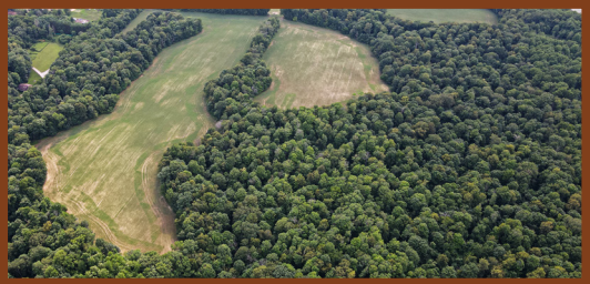
Looking from the Northeast corner of the property