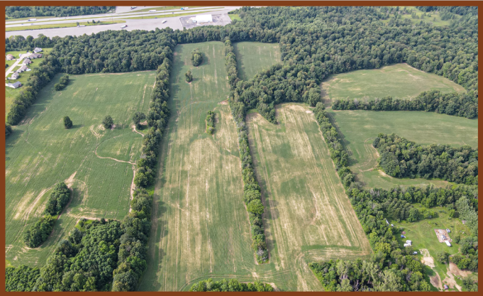
TOP: Aerial of the Western corner; looking North BOTTOM: Aerial of the Southeast corner