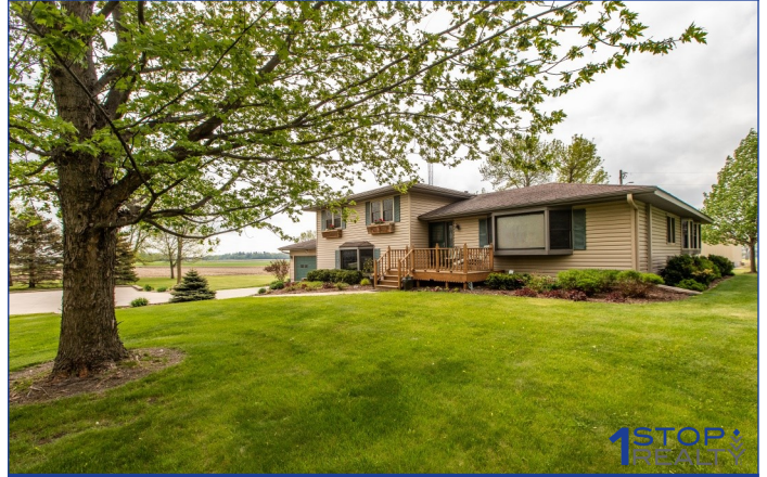
27289 590th St - Mantorville, MN