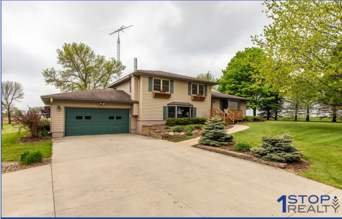
27289 590th St - Mantorville, MN