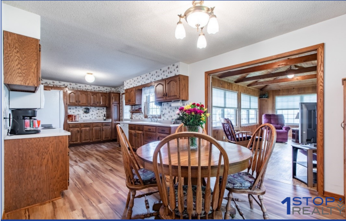
Kitchen/Dining Room/4-Season Porch