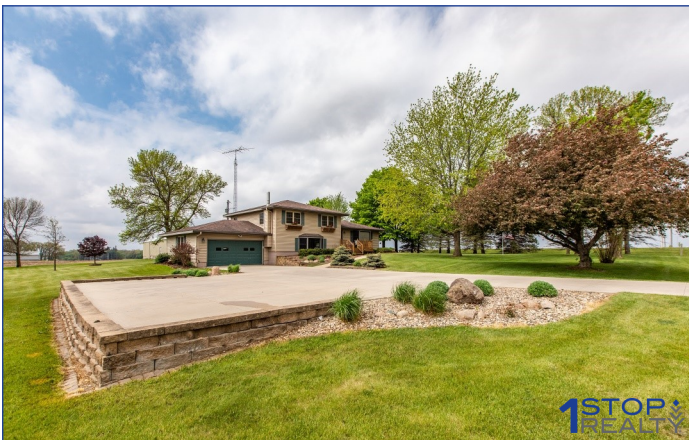
View of Entrance