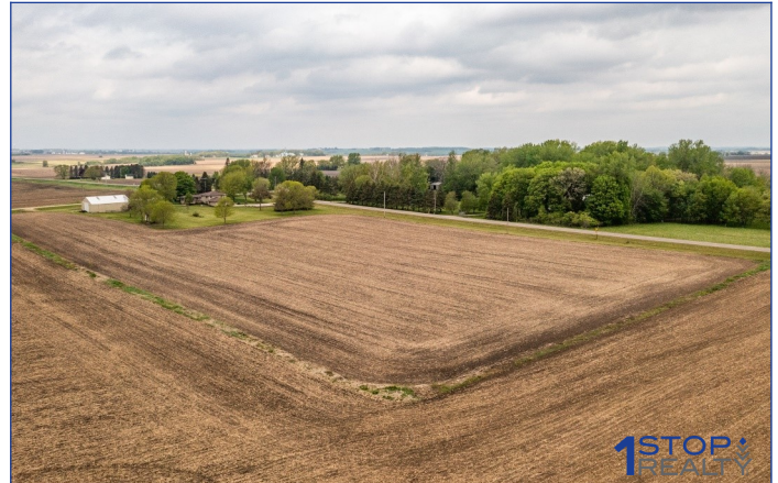
Additional 6.5 acres available