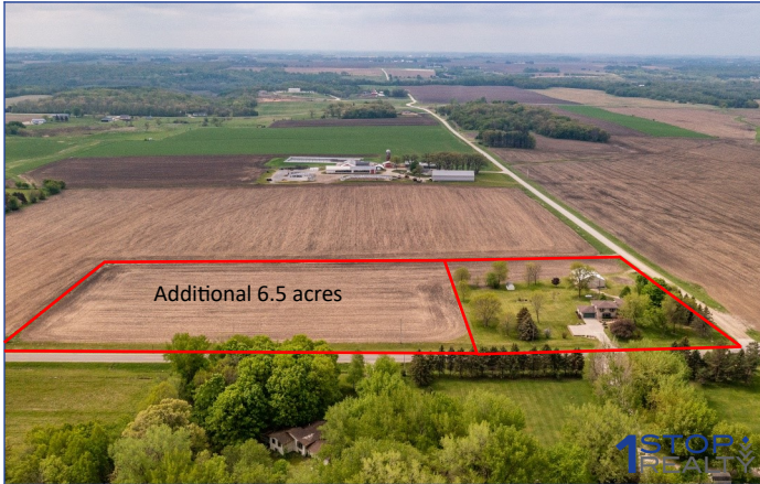
3.5 Acre Hobby Farm (Additional 6.5 acres available)