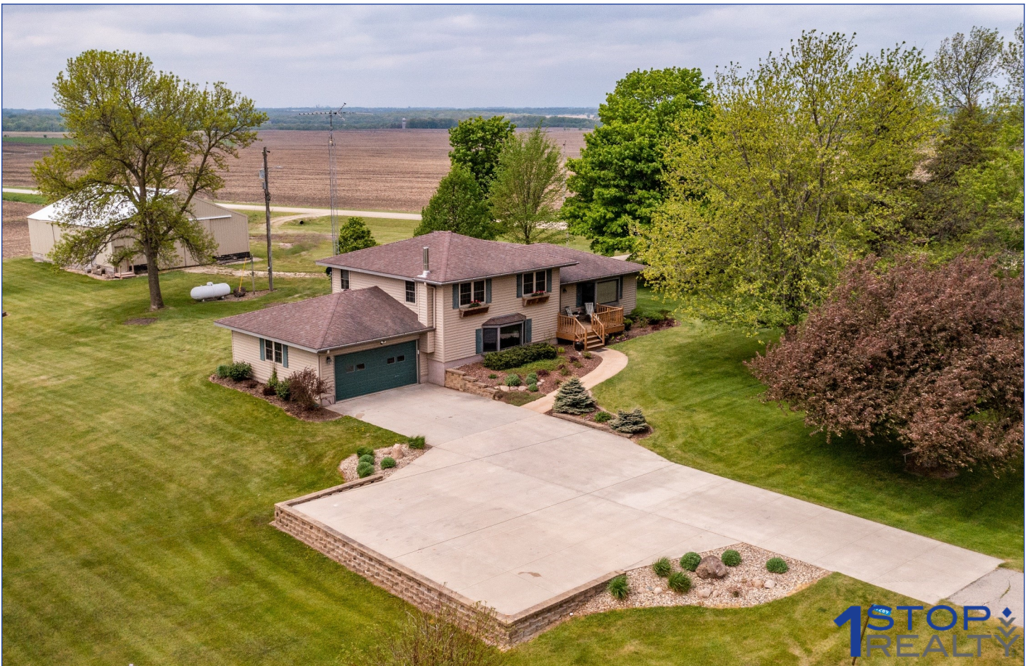
27289 590th Street - Mantorville, MN