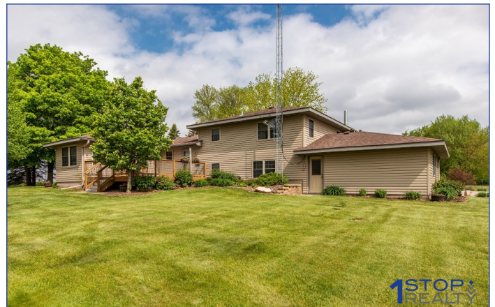
View of Back