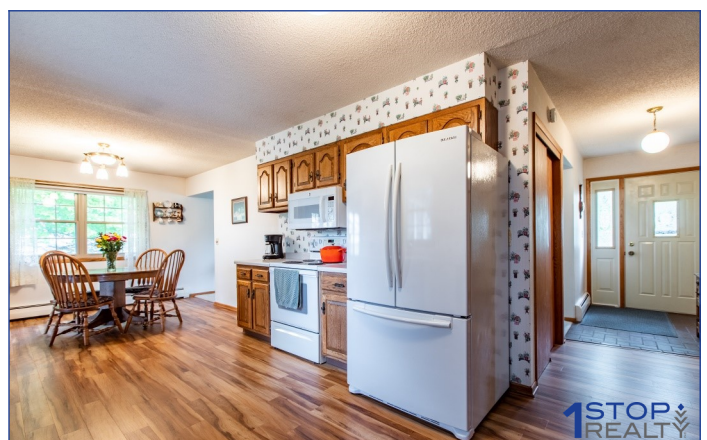
Dining Room/Kitchen/Entry Way