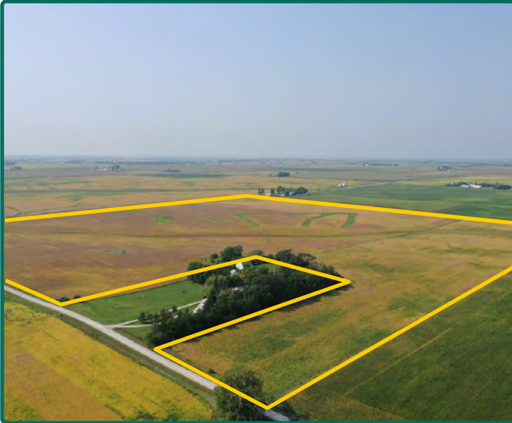
Northeast Looking Southwest