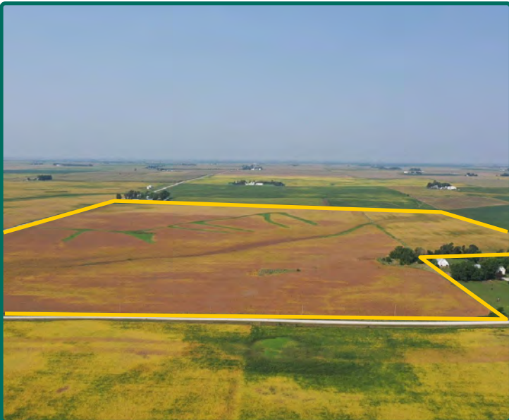
East Looking West