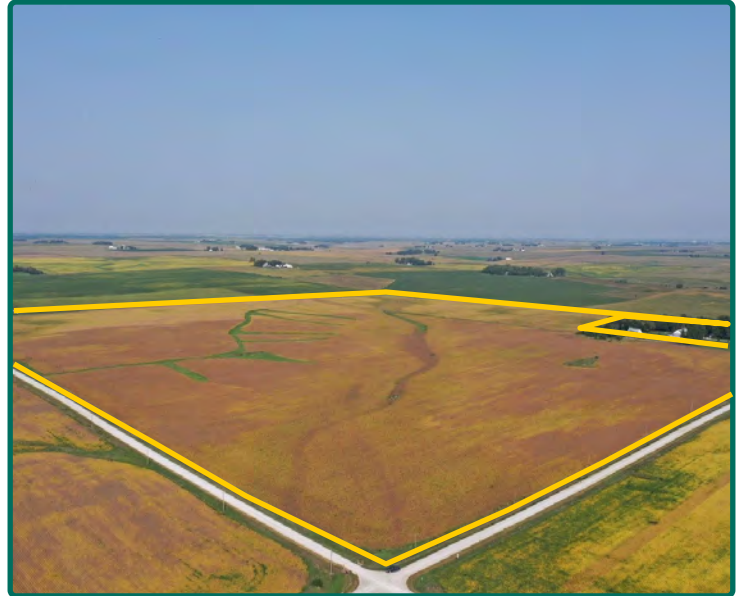
Southeast Looking Northwest