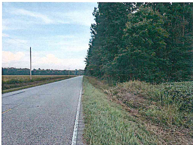
Road frontage on Cades Road, looking east. The Bynum tract is on the right of the road.