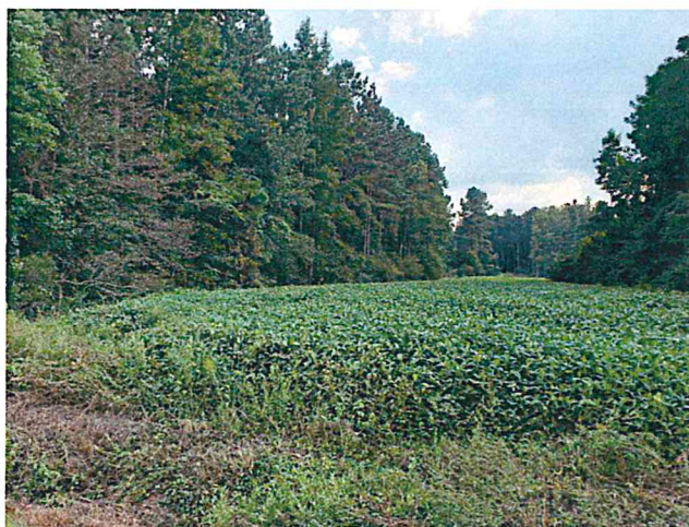
Cropland and woodland