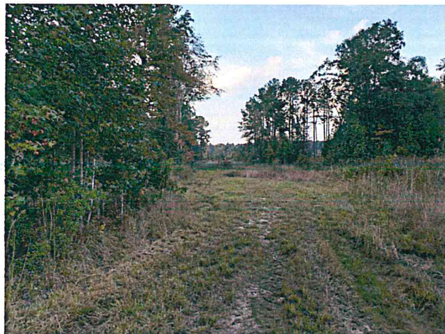
Cutover area on the southern portion of the tract.