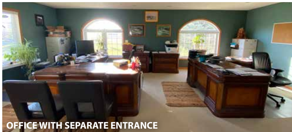
OFFICE WITH SEPARATE ENTRANCE