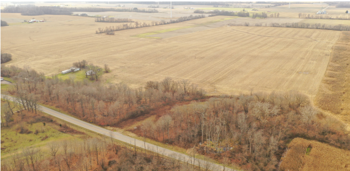
LOOKING WEST ALONG 800 W/HWY 1

75.74 +/- Tillable | 2.74 +/- Woods | 1.23 +/- Non-Tillable | 8.91 +/- Home