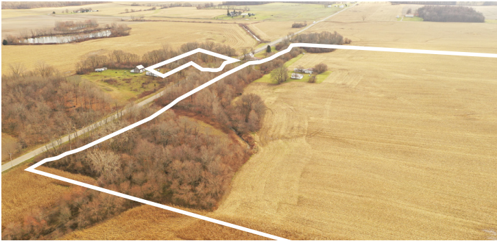
A VIEW OF BOTH PARCELS ALONG HWY 1