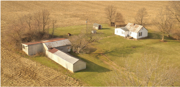
WEST HOME AND POLE BARN