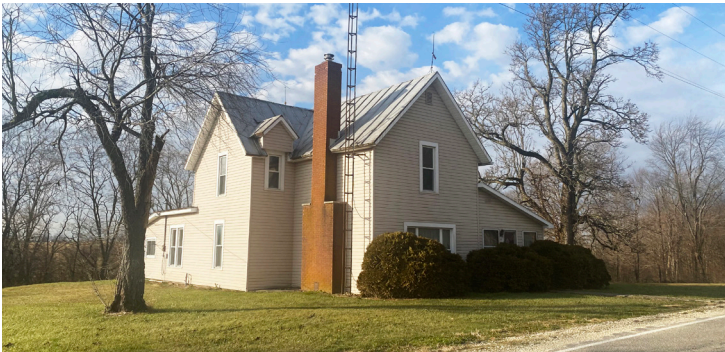
MAIN HOUSE ALONG 800 W/HWY 1