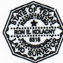
EXHIBIT "A" Page 3 of 4