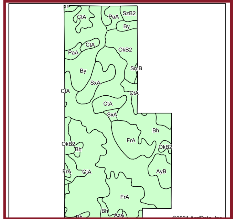
Area Symbol: IN111, Soil Area Version: 26