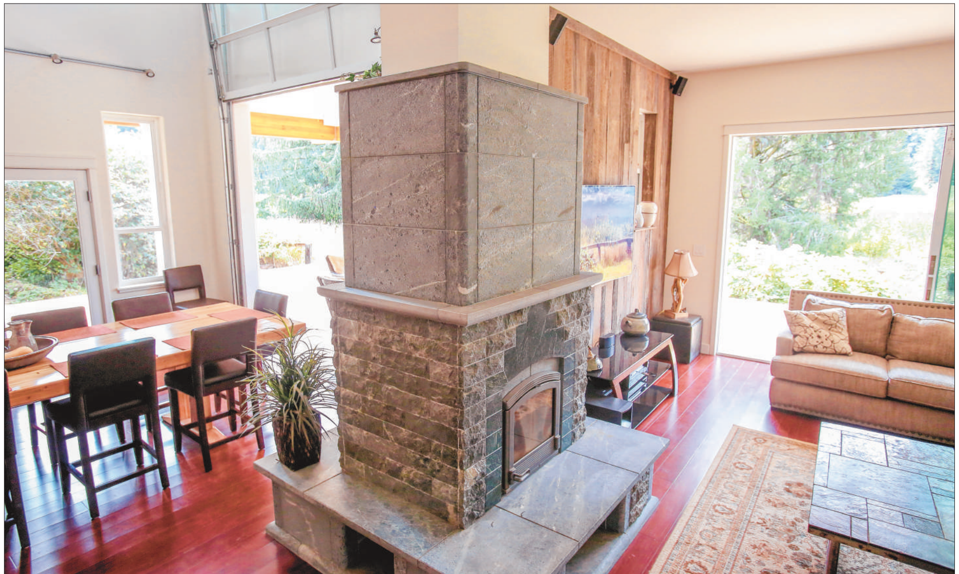
Pippenger says "everything about the place was designed so that the outdoors and the indoors were not far apart." Here, open glass doors wash the central living spaces in light and coastal breezes.