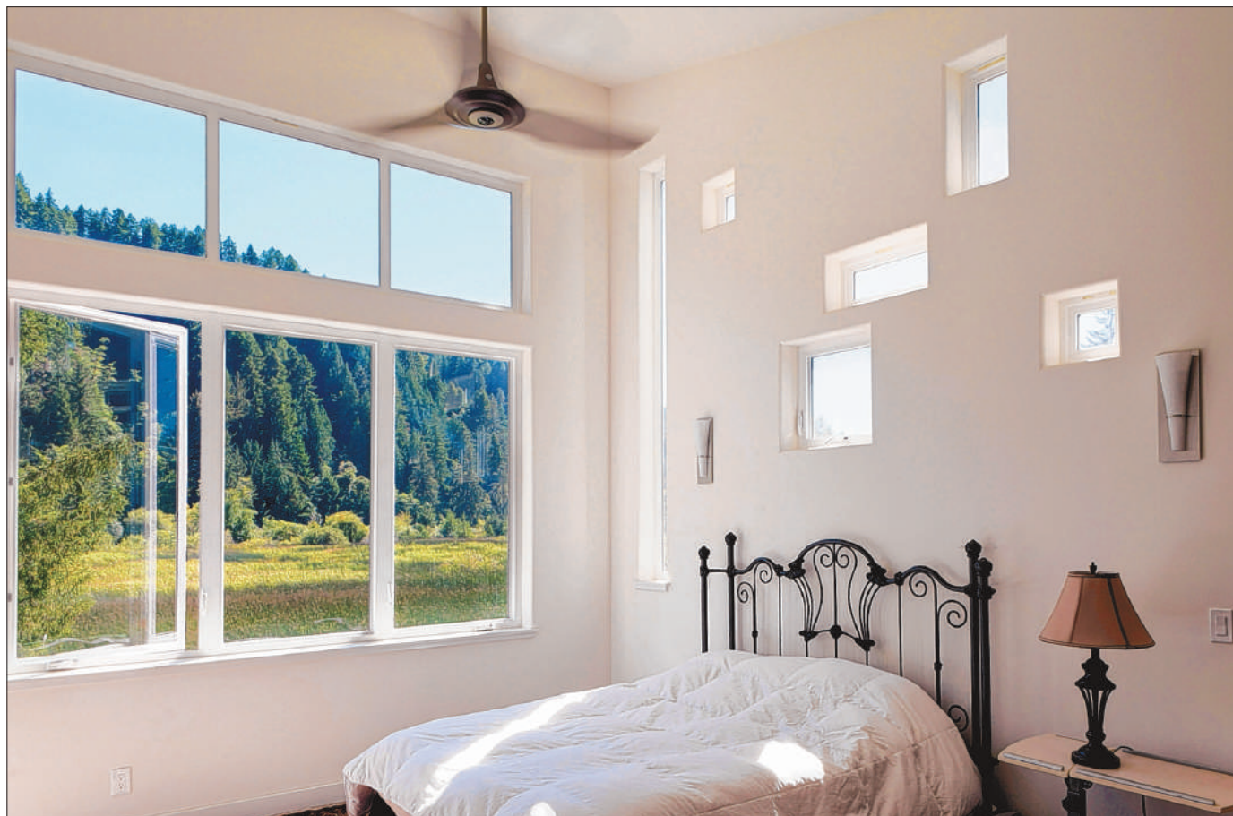
In the master bedroom, main windows let in the beauty of estuary marshes while a wall of small, mismatched windows add more light and interest.