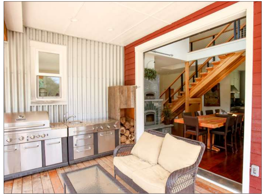
Roll-up glass door opens to connect this covered outdoor kitchen and seating area to the indoor dining area. When the door is closed, a portal allows access to the firewood bin, at center, for fueling the Tulikivi masonry fireplace, seen from either side in above and below photos.