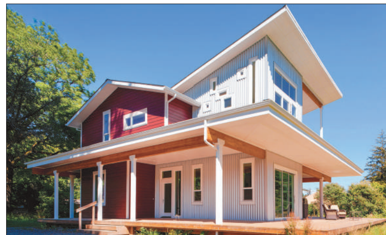
Clockwise from left: Open area beneath the south-facing shed roof features an industrial-size overhead fan and garage-style glass roll-up door; the upscale chef’s kitchen has commercial-grade appliances; exterior perspective shows juxtaposition of home’s distinct traditional and modern sides.