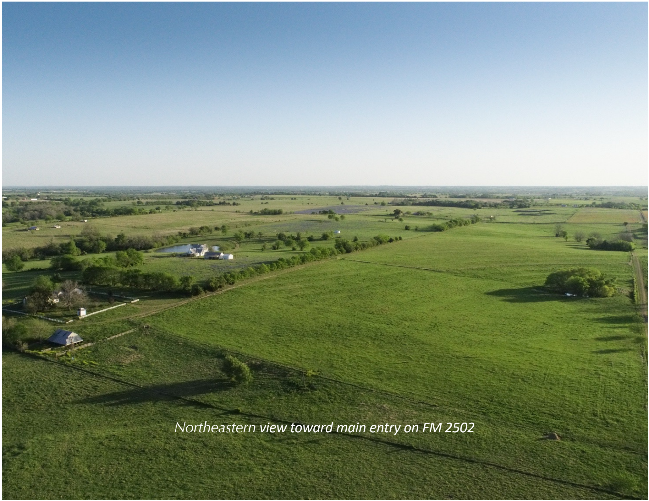
Northeastern view toward main entry on FM 2502