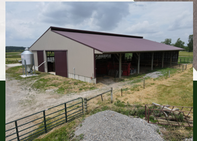
BARN 3 2007 72X90