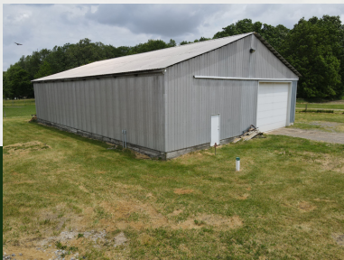
BARN 1 1996 56X80

This 156 acre farm is currently being utilized as a fully operational cattle business. The home was built in 2006, and all of the outbuildings were built after that with the exception of one. It has approximately 150 acres of pasture with heated automatic water systems ran to each pasture. It has 5 buildings and an owner's house situated on the premises. This is a rare opportunity to purchase a completely ready for business cattle operation in this part of the state. The pastureland could easily be converted to tillable acreage if the new owner doesn't have the need for all of the pasture. This property is centrally located between Kenton, Lima and Bellefontaine, Ohio making it a great centralized location to run your cattle or equestrian business.