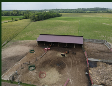
BARN 4 2008 40X90