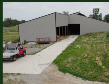
BARN 5 2020 90X104