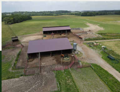
BARN 2 2006 45X72