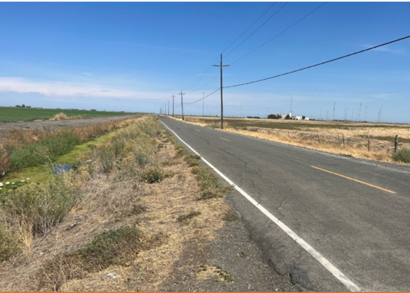
View E along Radio Station Rd. frontage