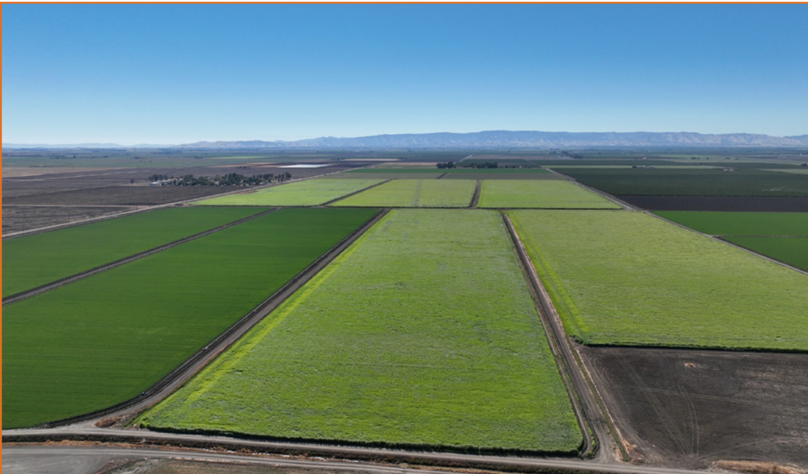
Aerial View W from E. Boundary