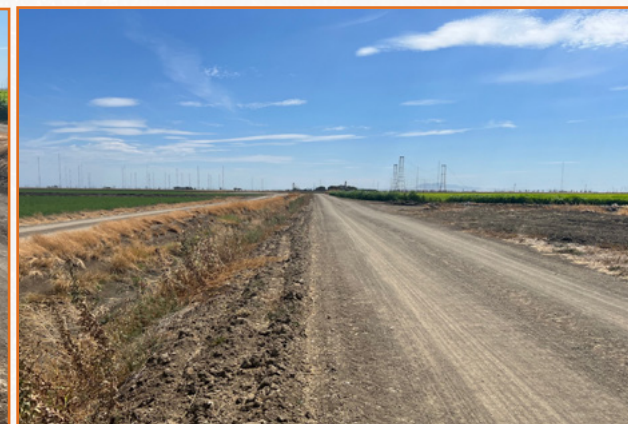
Misc. View down E. Bounday from NEC