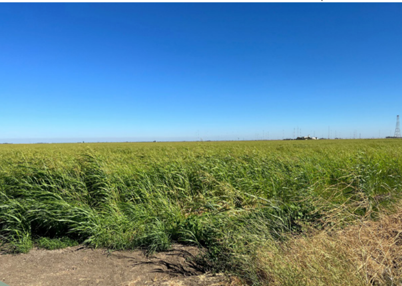
View of Sudan Grass Field from NWC