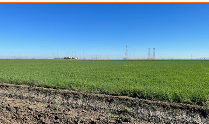
Standing Alfalfa Looking South