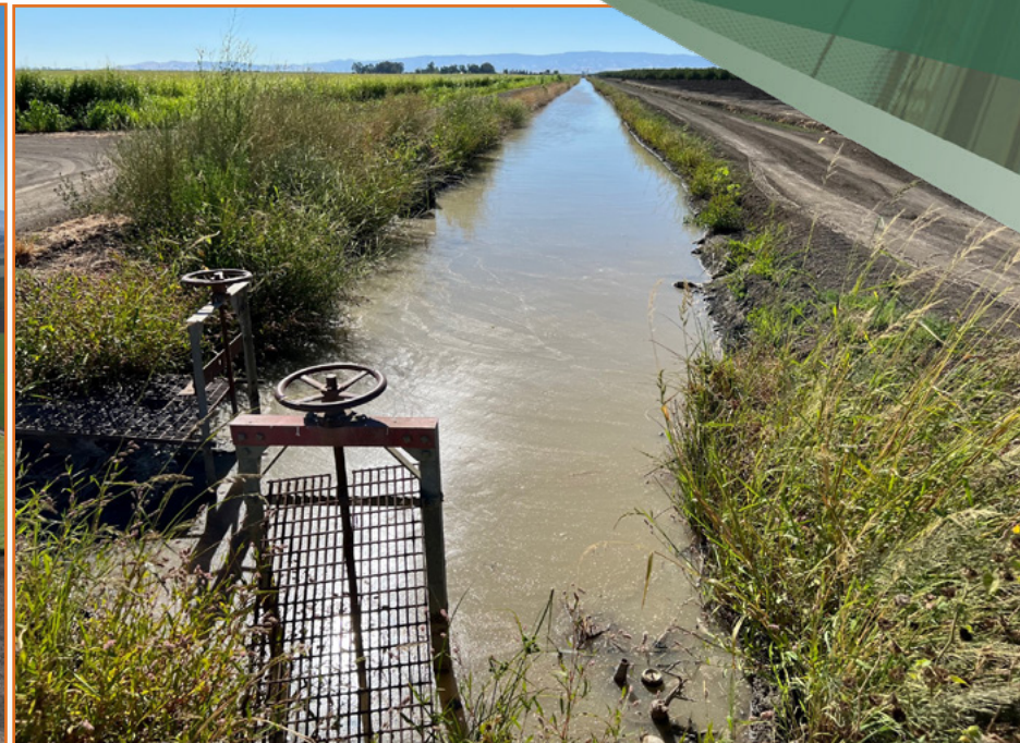
RD 2068 Irrig. Canal Turn-Out Gate