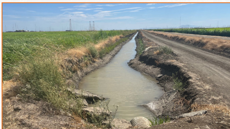
View Down Ditch Along W. Boundary