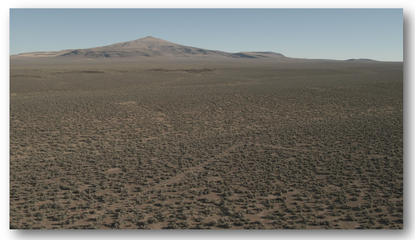
LOOKING SW TOWARDS BEATY BUTTE