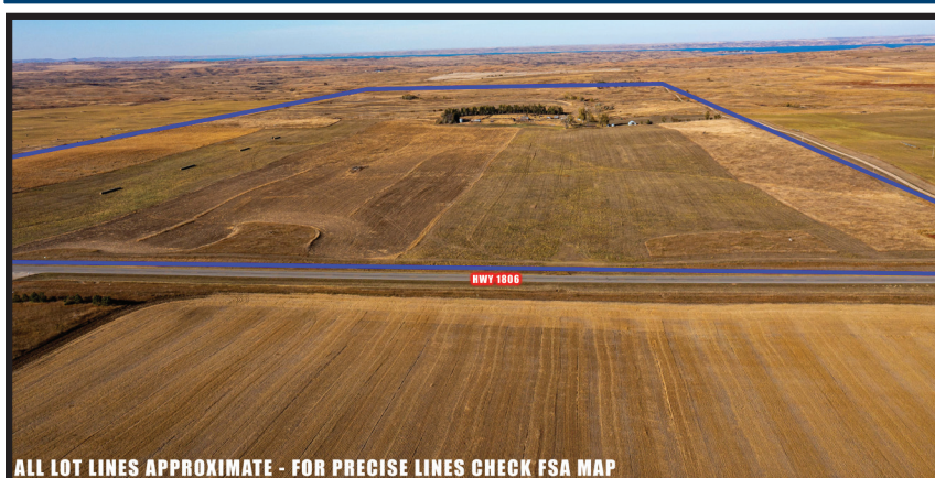
ALL LOT LINES APPROXIMATE - FOR PRECISE LINES CHECK FSA MAP

Driving Directions: From Golden Valley – (10) miles N-NW on Cty Rd 5 and (4) miles NW on Hwy 1806