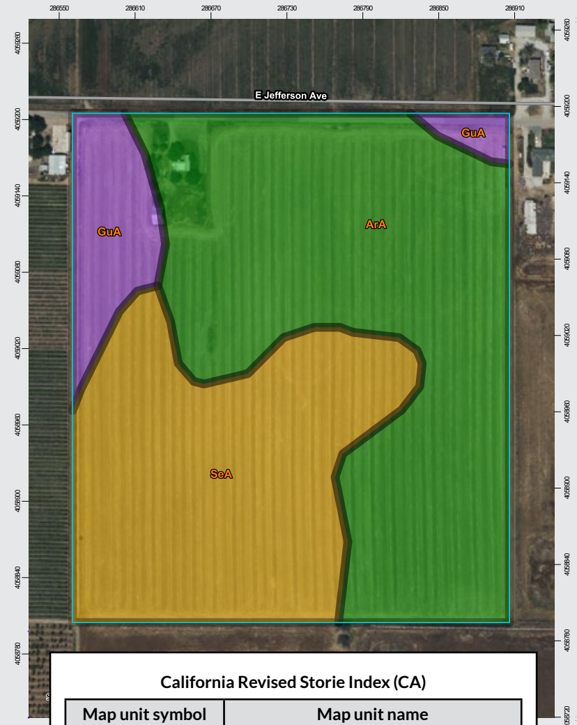
California Revised Storie Index (CA)