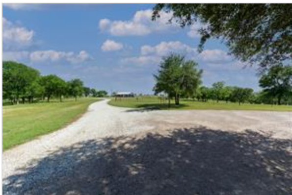
DRIVEWAY...View From Home Leading To The Barn And Property Entrance