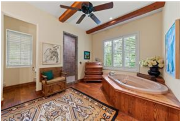
MASTER BATH...Extra Photo, Ceiling Fan, Jetted Tub, Plantation Shutters, Walk-In Closet W/Built-Ins