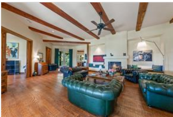
LIVING ROOM...Extra Photo, Pocket Doors At The Left Lead Into Office