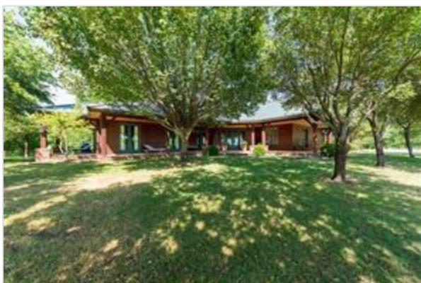
HOME AND PORCHES