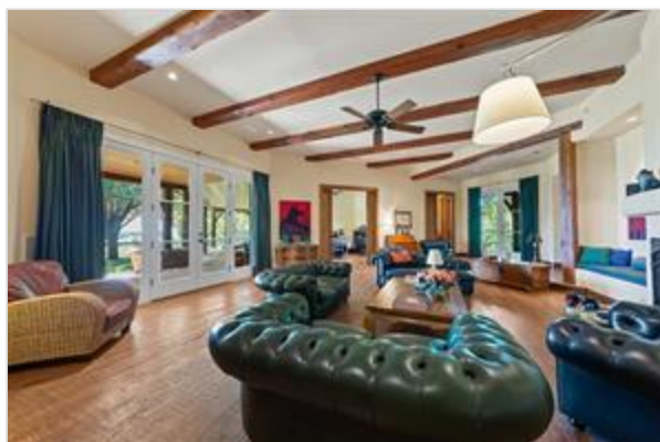
LIVING ROOM...Extra Photo, French Doors Lead To Covered Porches, Views Of Lake Ray Roberts From This Room!