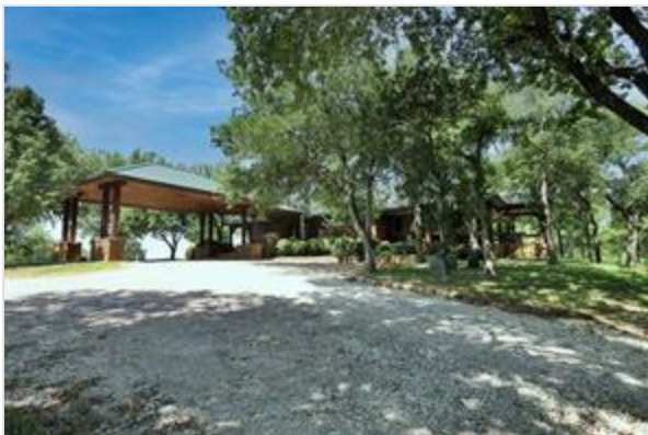
FRONT OF HOME...Extra Photo