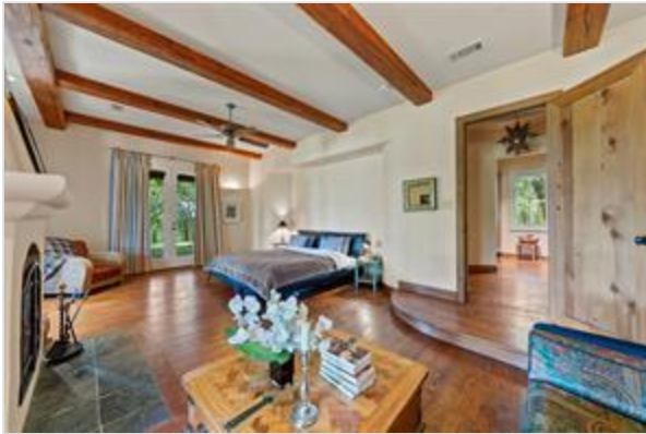
MASTER BEDROOM...Extra Photo