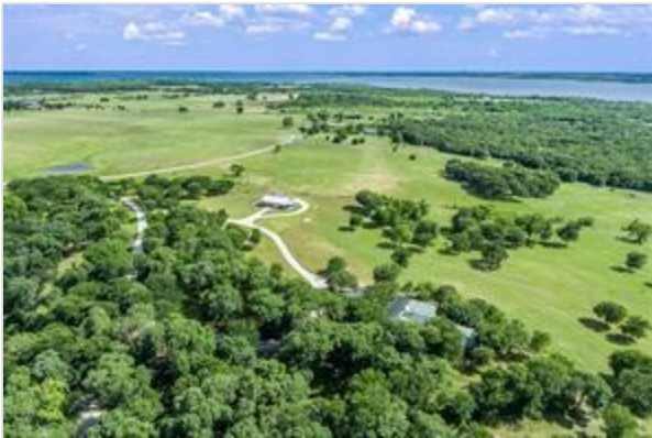
PROPERTY AERIAL...Extra Photo