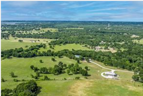
PROPERTY AERIAL...Extra Photo, View Of Barn And Home