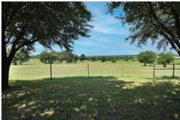
BEAUTIFUL PASTURE WITH SCATTERED TREES AND ROLLING TERRAIN