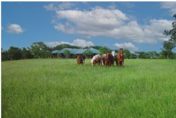
HOME AND COASTAL PASTURES