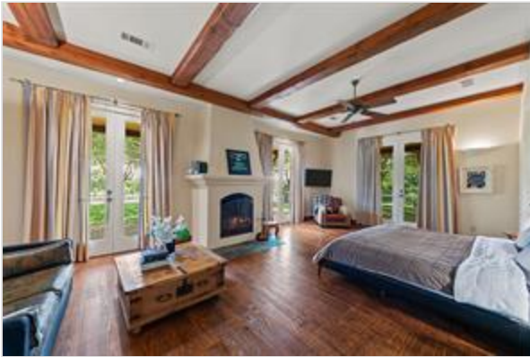
MASTER BEDROOM...Distressed Wood Floor, Wood Beam Ceiling, Fireplace, French Doors To Covered Porches