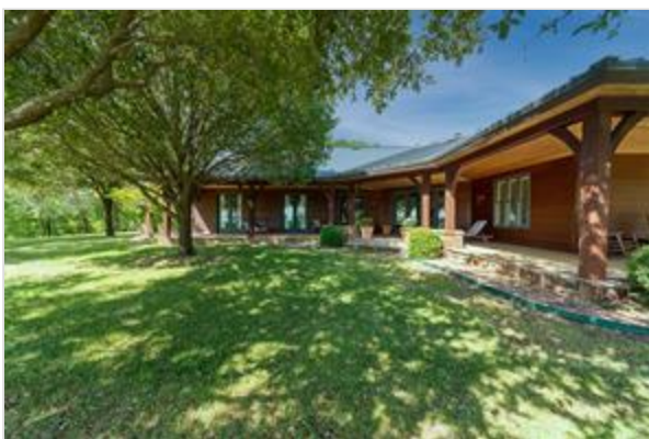
HOME AND PORCHES