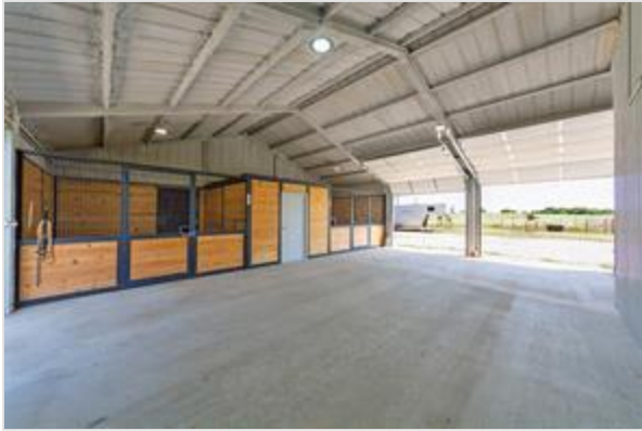
BARN INTERIOR...2 Stalls, Tack/Feed Room, Foam Insulated, Roll-Up Doors