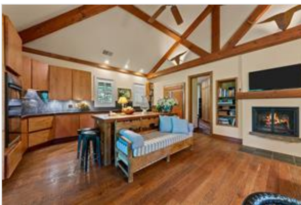
KITCHEN...Distressed Wood Floor, Vaulted Ceiling With Wood Beams, Granite Countertops, New Stainless Appliances, Plantation Shutters, Fireplace