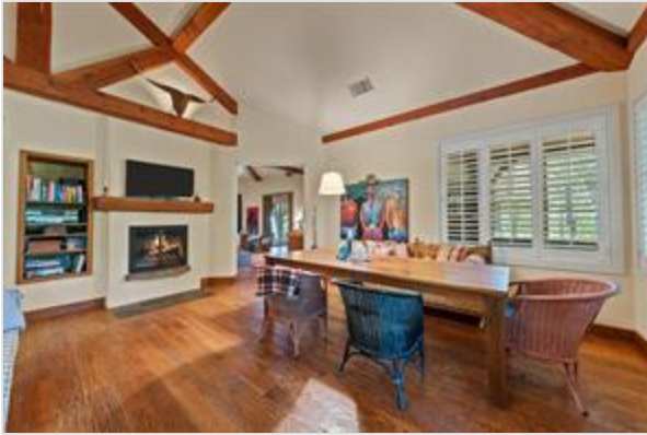
DINING AREA...Distressed Wood Floor, Fireplace, Plantation Shutters

MLS Number: 14614505 1045 Fm 3442, Valley View, Texas 76272