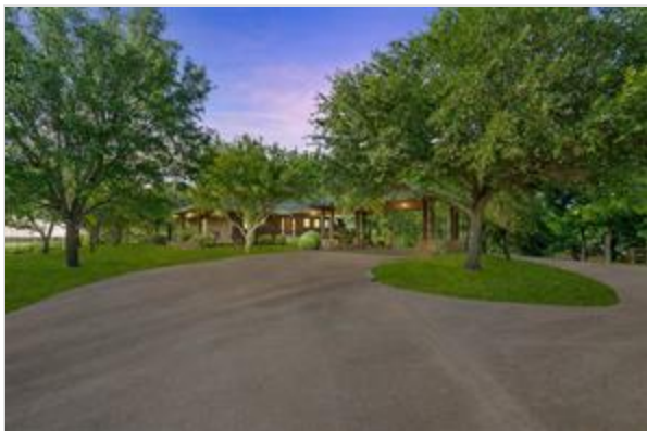
FRONT OF HOME...Redwood And Stone Exterior, Wrap Around Porches, Attached Porte Cochere

MLS Number: 14614505 1045 Fm 3442, Valley View, Texas 76272