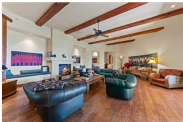
LIVING ROOM...Distressed Wood Floor, Wood Beam Ceiling, Wood Burning Fireplace

MLS Number: 14614505 1045 Fm 3442, Valley View, Texas 76272