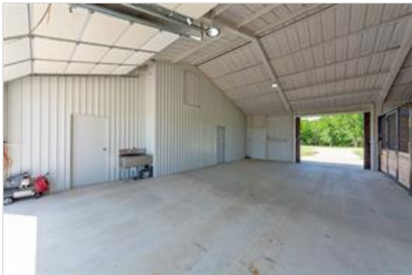
BARN INTERIOR...2 Doors Lead Into Office/Lounge