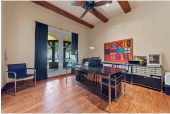
OFFICE...Distressed Wood Floor, Wood Beam Ceiling, French Doors Lead To Covered Porch With Views Of Lake Ray Roberts