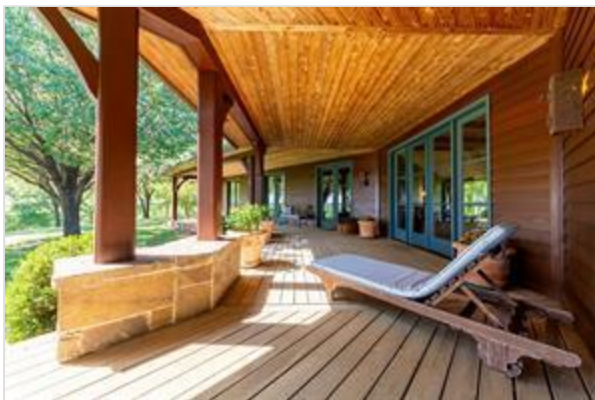
COVERED PORCHES...Located Off Living Room