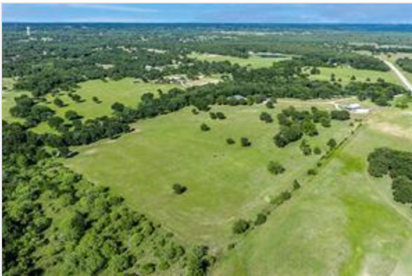
PROPERTY AERIAL...Extra Photo, View Of Beautiful Coastal Pastures