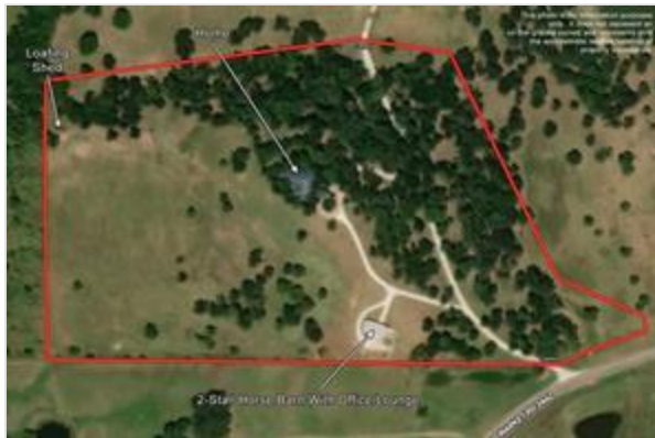
SATELLITE AERIAL...Property Outlines Are Approximate