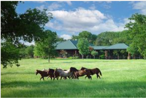
FRONT OF HOME...Amazing Redwood And Stone Home With Standing Seam Metal Roof. This Gorgeous Property Offers Privacy, Beautiful Hilltop Views Of Lake Ray Roberts And The Countryside

MLS Number: 14614505 1045 Fm 3442, Valley View, Texas 76272