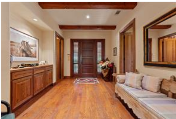
FOYER...Distressed Wood Floor, Wood Beam Ceiling, Half Bath Off Foyer On One Side And Guest Bedroom With Full Bath Off Other Side