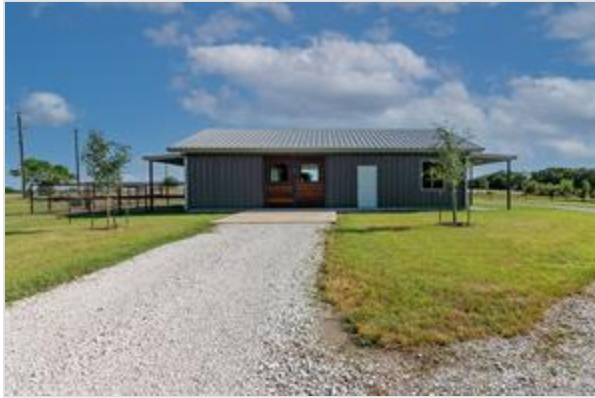
BARN EXTERIOR...36x48, Insulated, 2 Stalls W/Runs, Office/Lounge With Full Bath, Storage Room And Central Heat/Air

MLS Number: 14614505 1045 Fm 3442, Valley View, Texas 76272