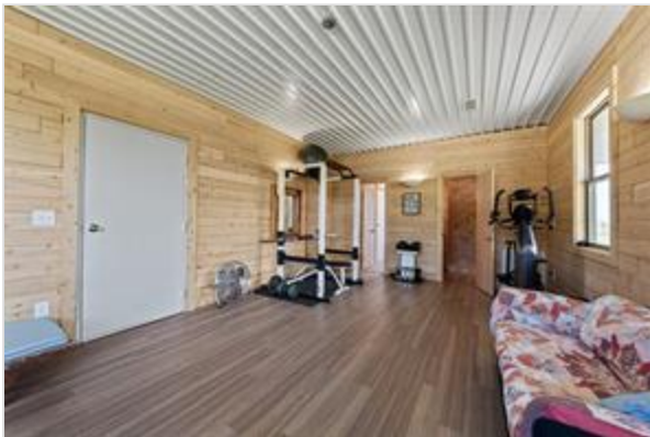
BARN OFFICE/LOUNGE INTERIOR...Offers A Full Bath And Large Storage Room With Central Heat/Air