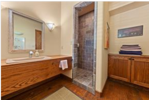
GUEST BATH...Distressed Wood Floor, Tile Shower, Built-Ins