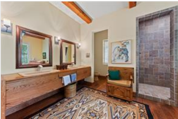
MASTER BATH...Distressed Wood Floor, Wood Beam Ceiling, Double Vanity, Bidet, Walk-In Tile Shower