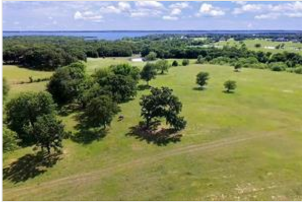
AERIAL VIEW OF COASTAL PASTURE...Views Of Lake Ray Roberts

MLS Number: 14614505 1045 Fm 3442, Valley View, Texas 76272