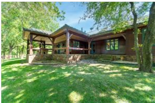
HOME AND PORCHES