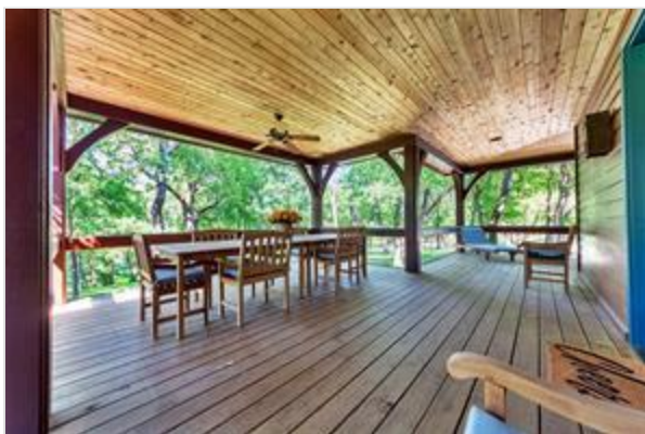
COVERED PORCHES...Located Off Kitchen And Dining