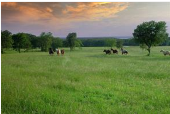
BEAUTIFUL COASTAL PASTURES...Distant Views Of Lake Ray Roberts