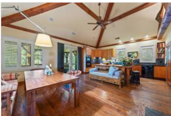
DINING AREA AND KITCHEN...Appliances Have Recently Been Updated To Stainless