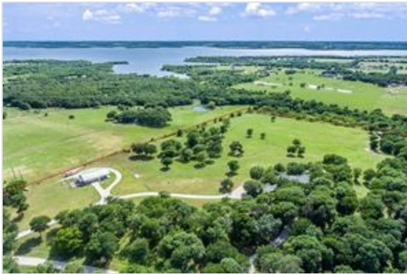
PROPERTY AERIAL...This Property Is First-Class! It Offers A Hilltop Setting For The Home, Land Elevation Changes, Trees, Coastal Pastures, High Quality Home And Horse Barn, Property Outline Is Approx.