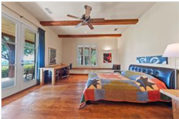
BEDROOM 2...Distressed Wood Floor, French Doors To Covered Porch, Plantation Shutters, Wood Beam Ceiling

MLS Number: 14614505 1045 Fm 3442, Valley View, Texas 76272