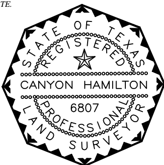
EXHIBIT "A" ONCOR ELECTRIC DELIVERY CO. LLC